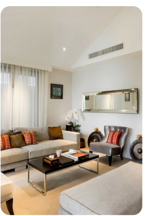
Phang Nga 4475 | Page 7 of 8