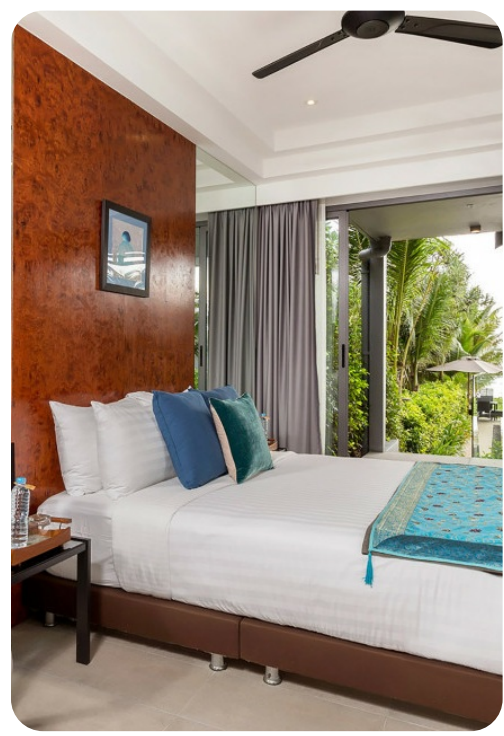
Phang Nga 4475 | Page 3 of 8