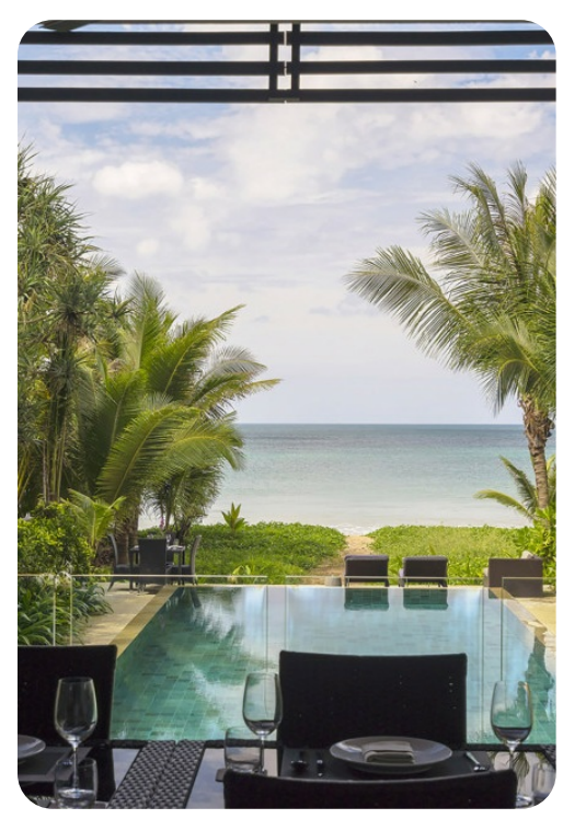
Phang Nga 4475 | Page 2 of 8