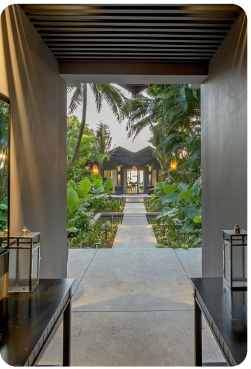
Phang Nga 4475 | Page 8 of 8