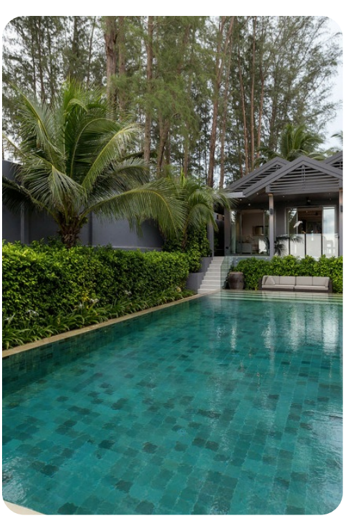
Phang Nga 4475 | Page 4 of 8