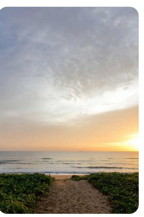
Phang Nga 4475 | Page 5 of 8