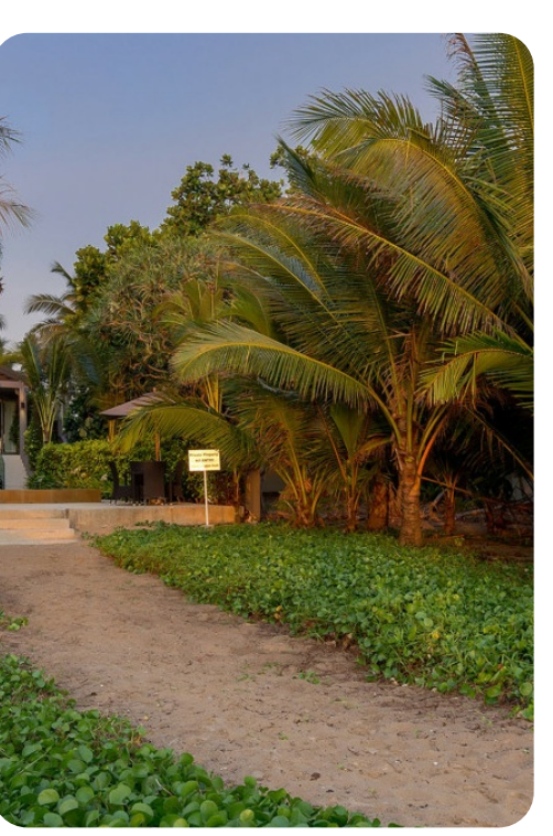
Phang Nga 4475 | Page 6 of 8