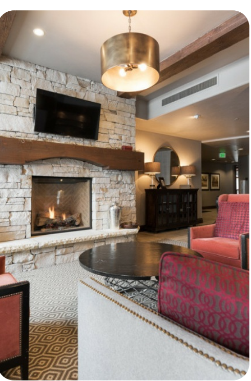
Park City 98 | Page 7 of 8