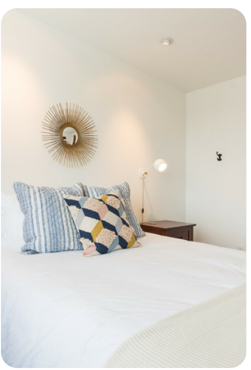
Park City 98 | Page 5 of 8