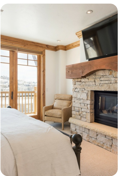
Park City 98 | Page 4 of 8