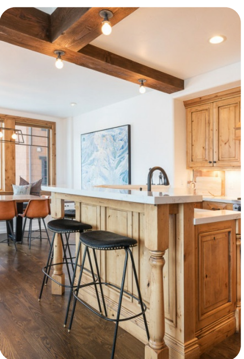
Park City 98 | Page 3 of 8