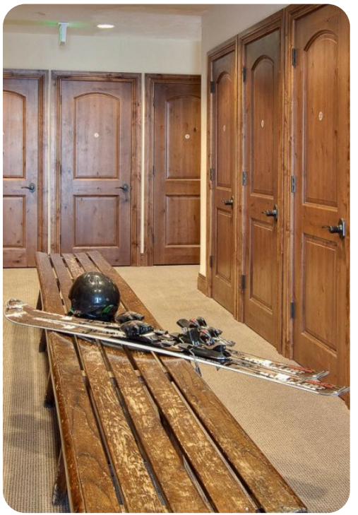
Park City 98 | Page 8 of 8