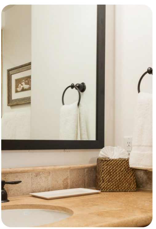
Park City 98 | Page 6 of 8