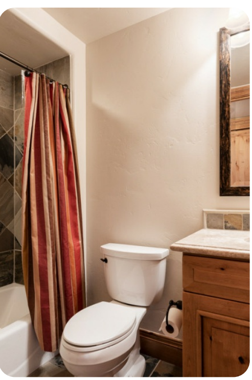
Park City 93 | Page 6 of 8