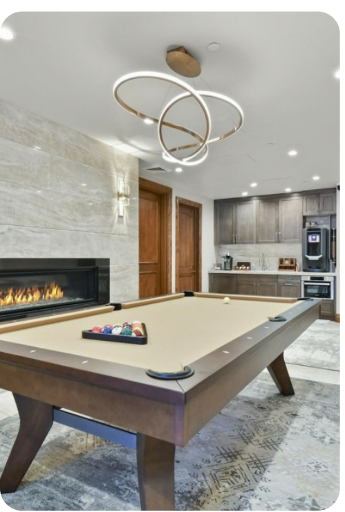
Park City 93 | Page 8 of 8