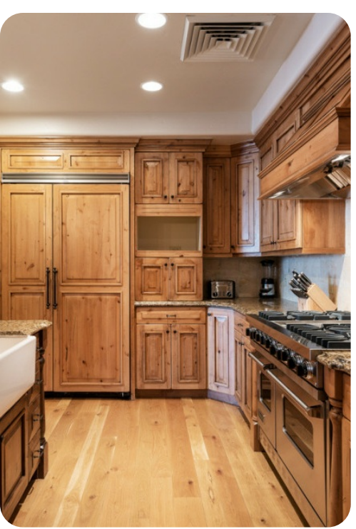
Park City 93 | Page 4 of 8