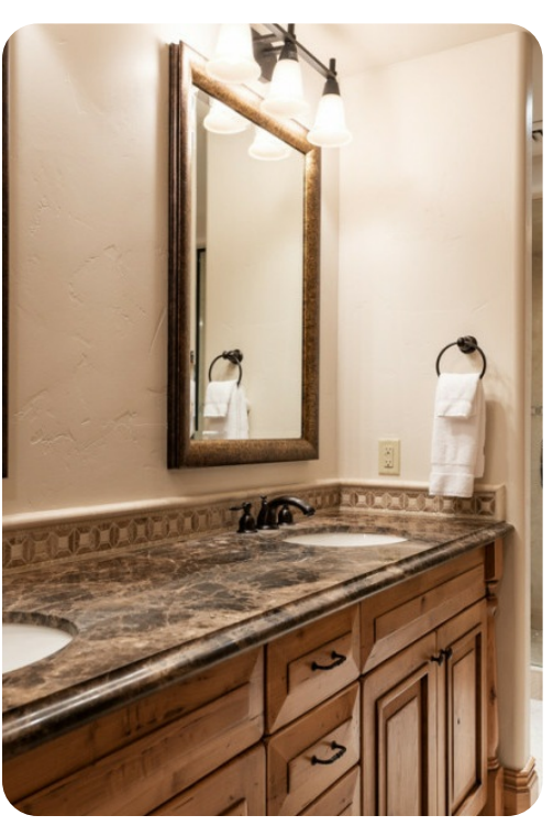
Park City 93 | Page 5 of 8