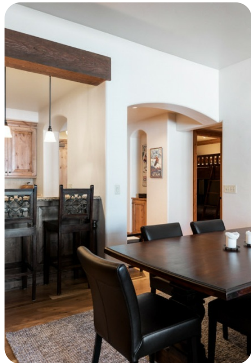
Park City 93 | Page 3 of 8