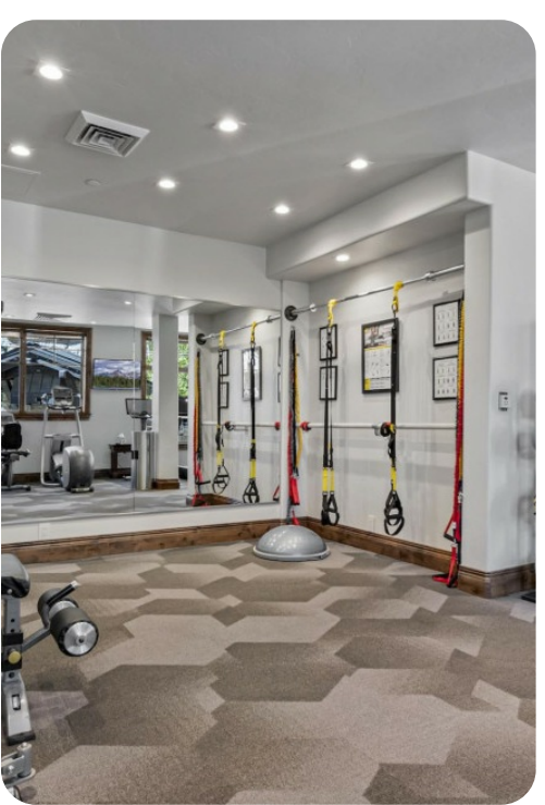
Park City 93 | Page 7 of 8