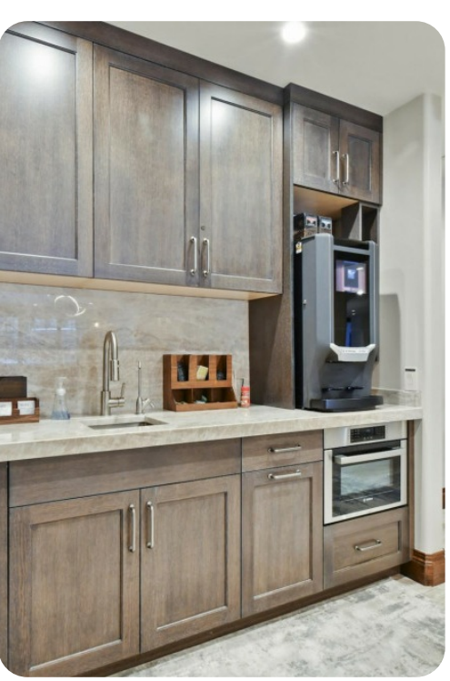
Park City 90 | Page 7 of 8