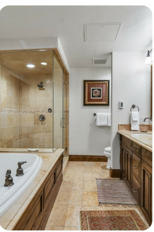
Park City 90 | Page 5 of 8