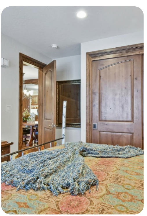
Park City 90 | Page 4 of 8