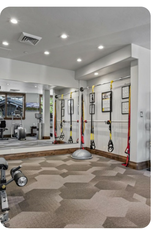
Park City 90 | Page 8 of 8