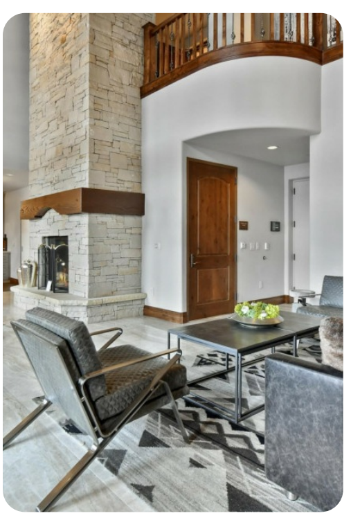
Park City 90 | Page 6 of 8