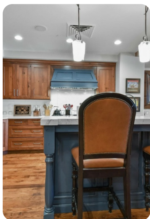
Park City 90 | Page 3 of 8