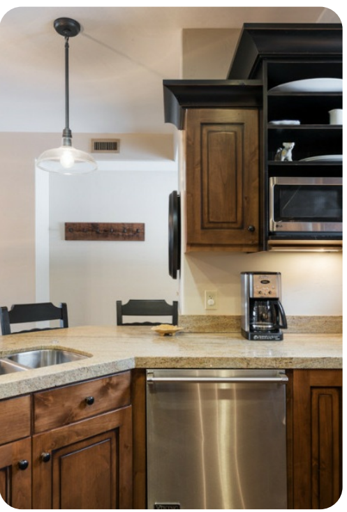
Park City 78 | Page 3 of 6