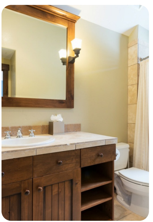
Park City 78 | Page 5 of 6