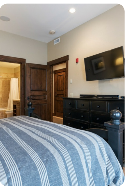
Park City 78 | Page 4 of 6