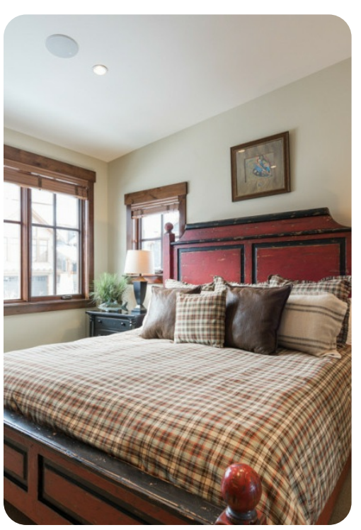
Park City 6 | Page 5 of 8