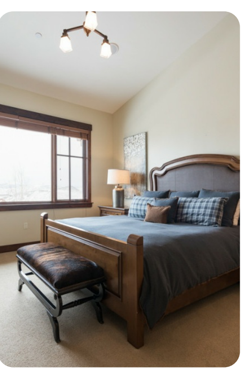
Park City 6 | Page 4 of 8