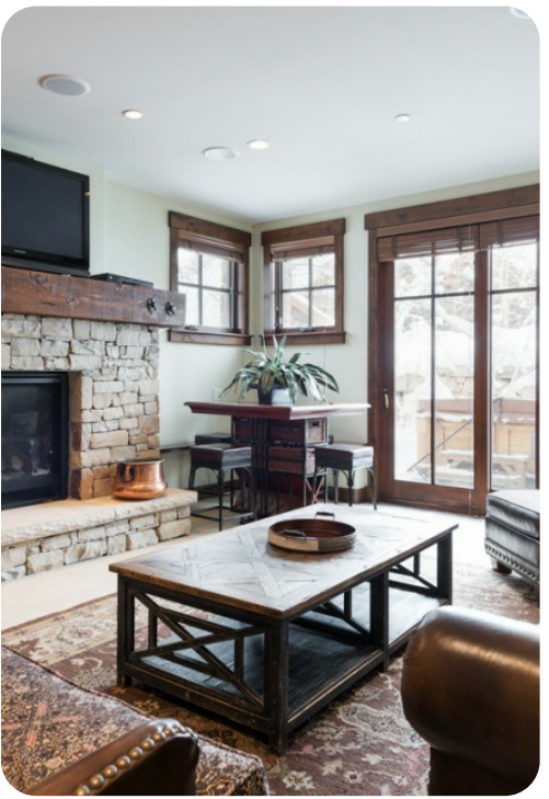
Park City 6 | Page 8 of 8