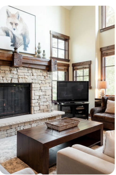
Park City 6 | Page 2 of 8