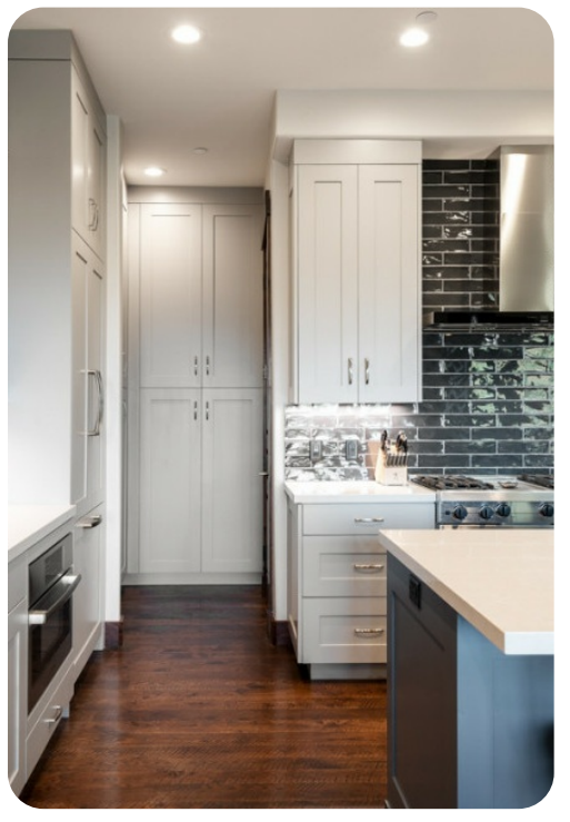
Park City 6 | Page 3 of 8