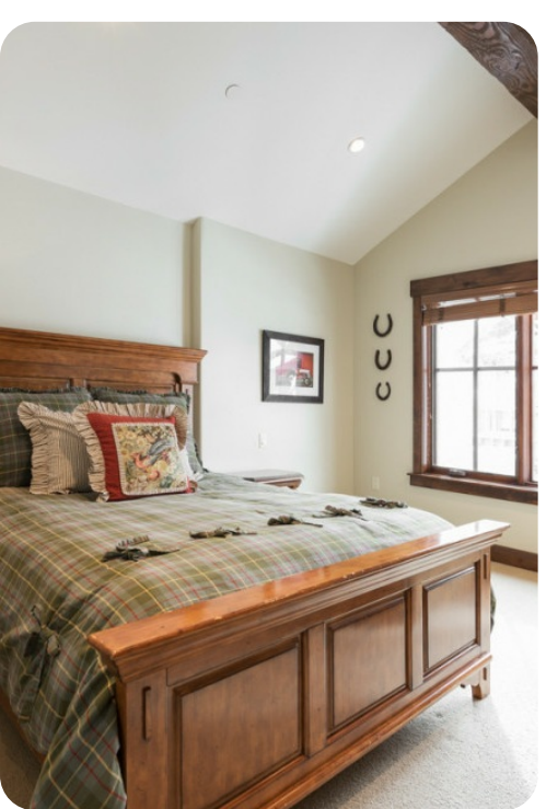
Park City 6 | Page 6 of 8