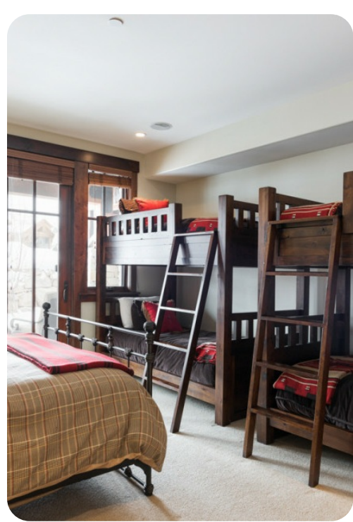
Park City 6 | Page 7 of 8