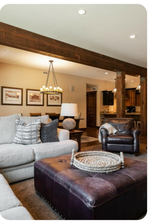
Park City 56 | Page 2 of 5