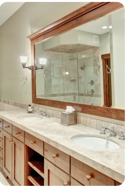
Park City 56 | Page 3 of 5