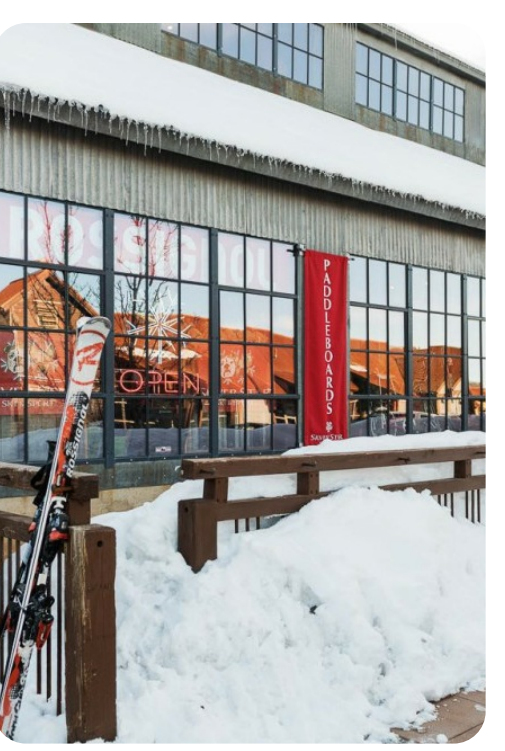
Park City 56 | Page 4 of 5