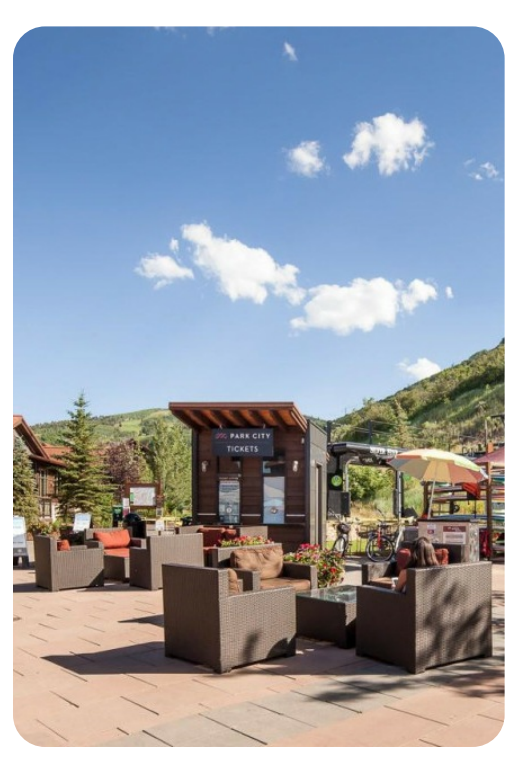
Park City 56 | Page 5 of 5