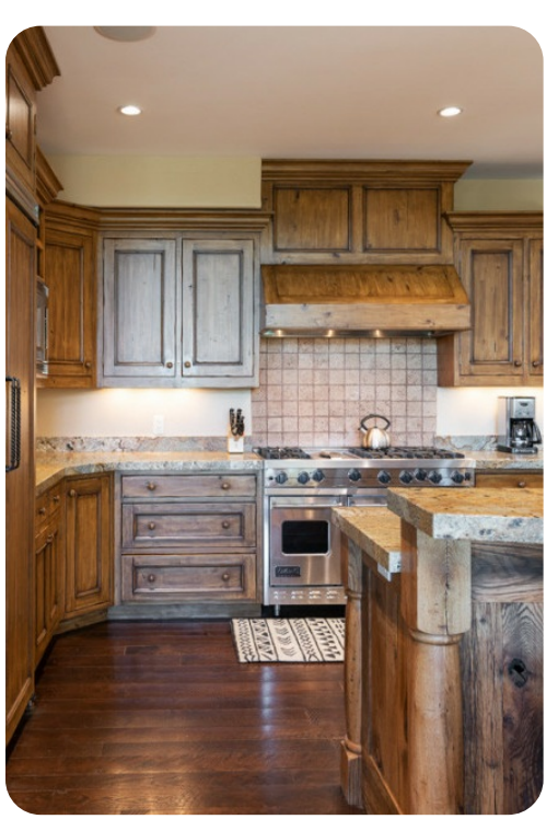
Park City 52 | Page 3 of 8