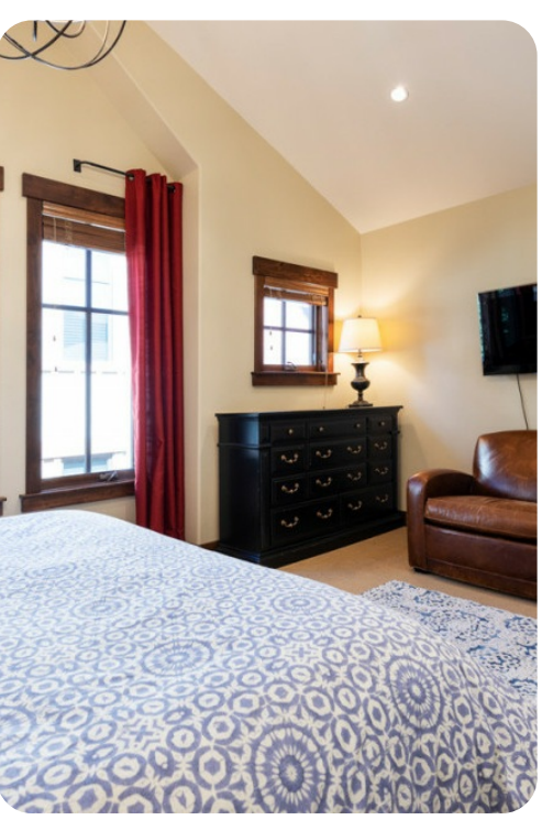
Park City 52 | Page 5 of 8