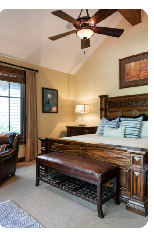
Park City 52 | Page 4 of 8