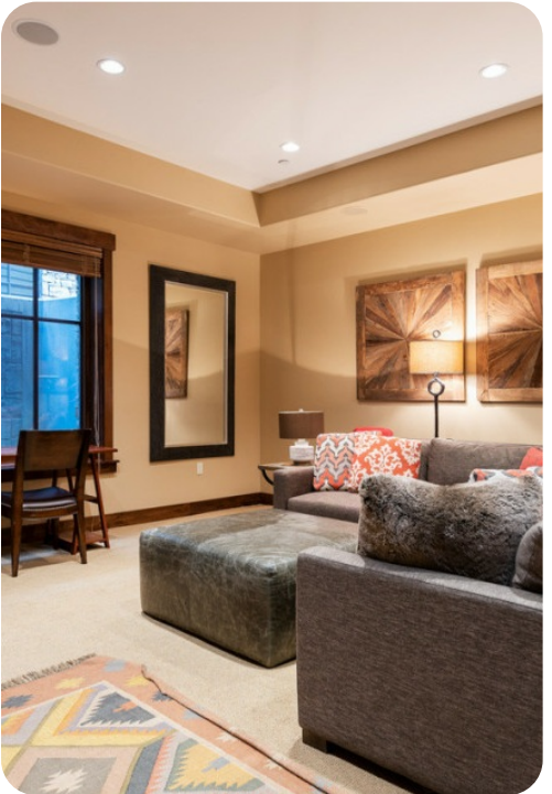
Park City 52 | Page 8 of 8