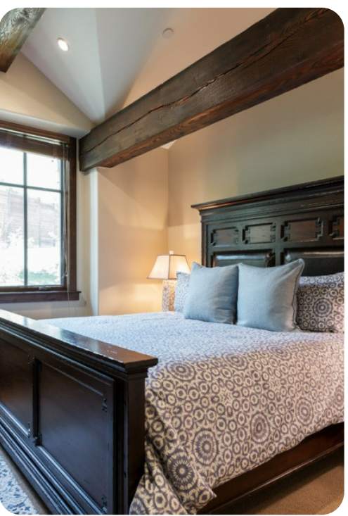
Park City 52 | Page 6 of 8