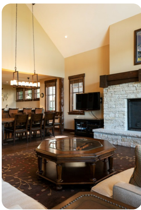
Park City 52 | Page 2 of 8