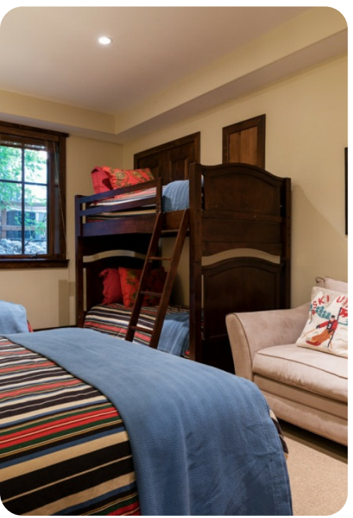
Park City 52 | Page 7 of 8