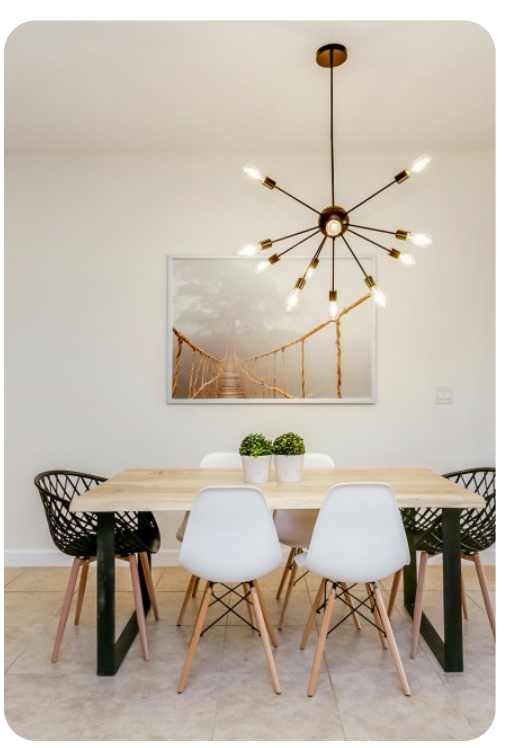
Paradise Palms Resort 85 | Page 5 of 8