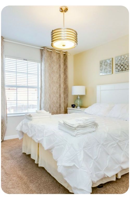
Paradise Palms Resort 85 | Page 7 of 8