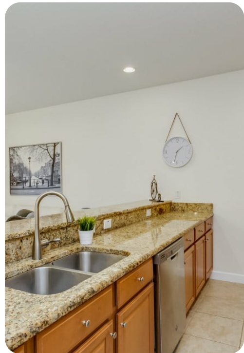
Paradise Palms Resort 85 | Page 3 of 8