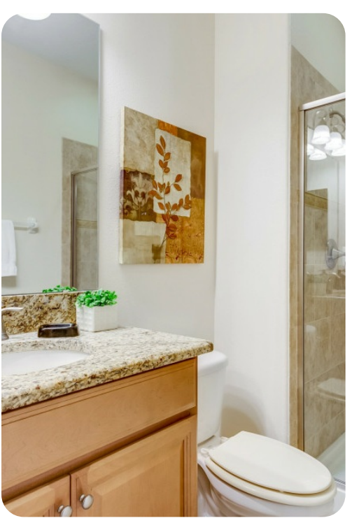
Paradise Palms Resort 85 | Page 6 of 8