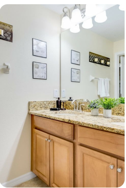
Paradise Palms Resort 85 | Page 8 of 8