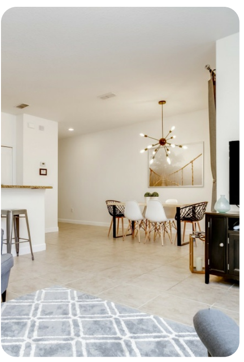
Paradise Palms Resort 85 | Page 4 of 8