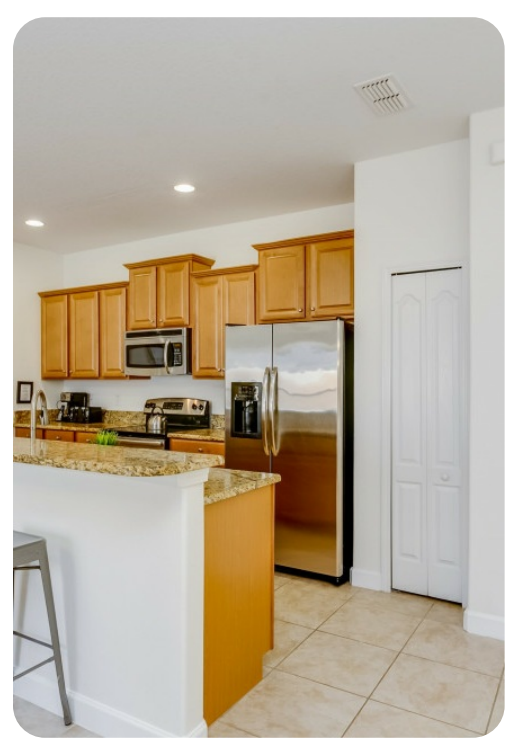
Paradise Palms Resort 85 | Page 2 of 8