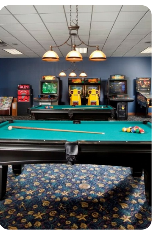
Paradise Palms Resort 280 | Page 6 of 8