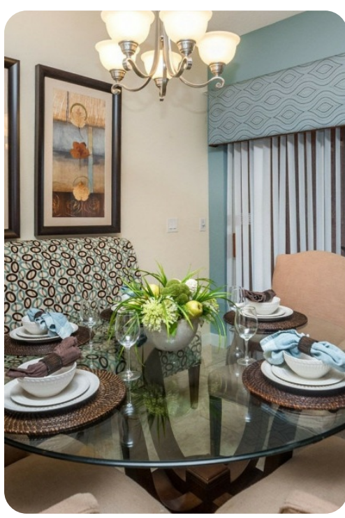
Paradise Palms Resort 280 | Page 2 of 8