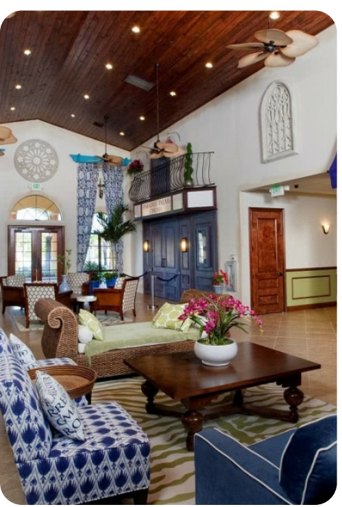
Paradise Palms Resort 280 | Page 5 of 8