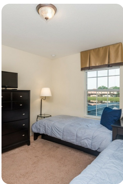
Paradise Palms Resort 280 | Page 4 of 8