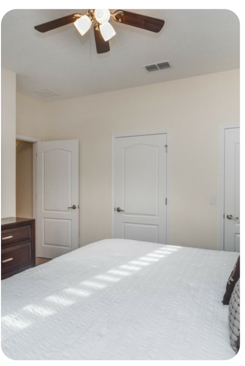
Paradise Palms Resort 280 | Page 3 of 8