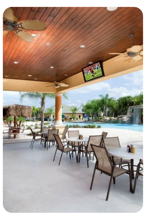
Paradise Palms Resort 280 | Page 7 of 8