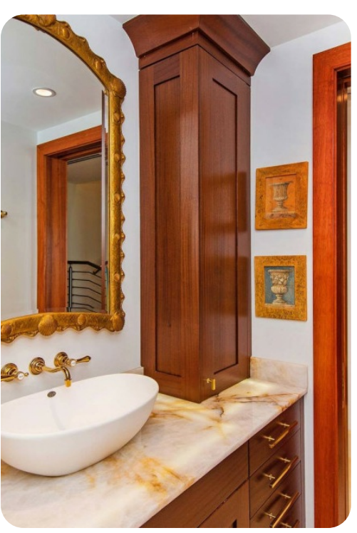
Paradis Sur Mer | Page 5 of 8