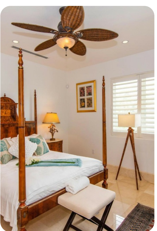
Paradis Sur Mer | Page 6 of 8