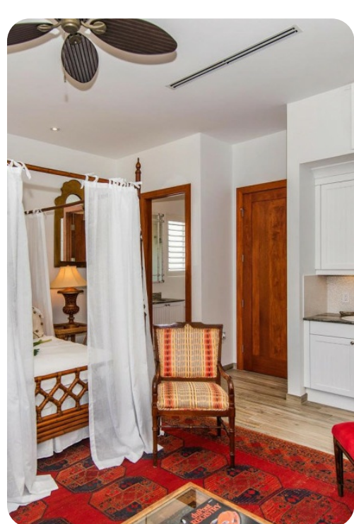
Paradis Sur Mer | Page 7 of 8