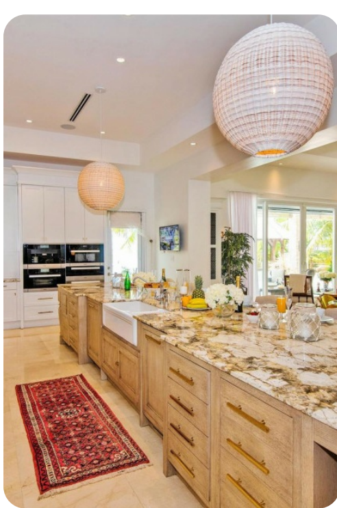
Paradis Sur Mer | Page 2 of 8