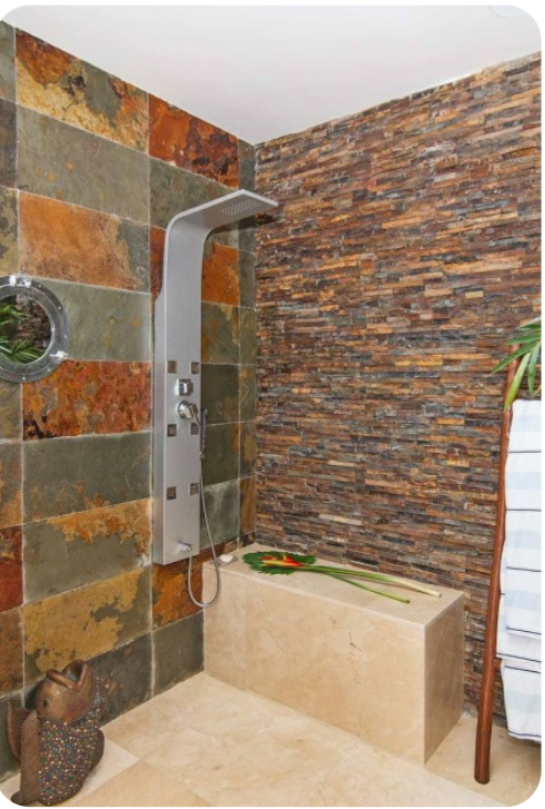
Paradis Sur Mer | Page 8 of 8