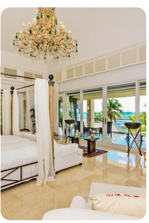
Paradis Sur Mer | Page 4 of 8