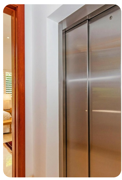
Paradis Sur Mer | Page 3 of 8