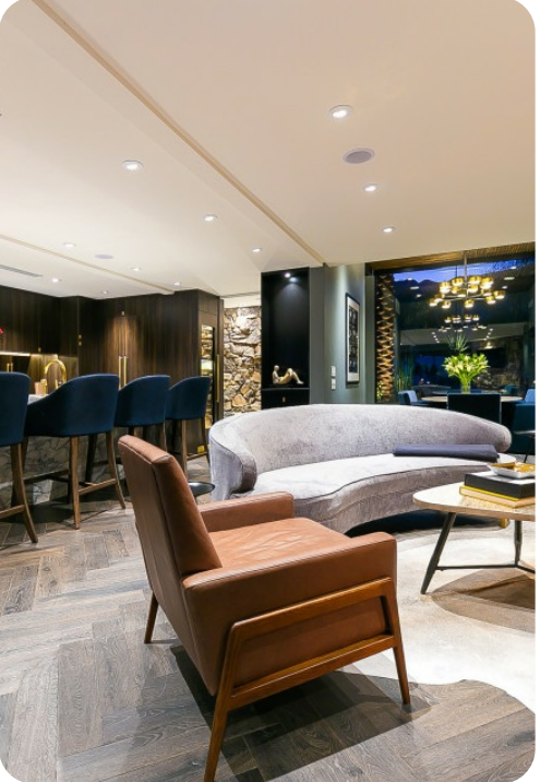
Palm Springs 35 | Page 2 of 8