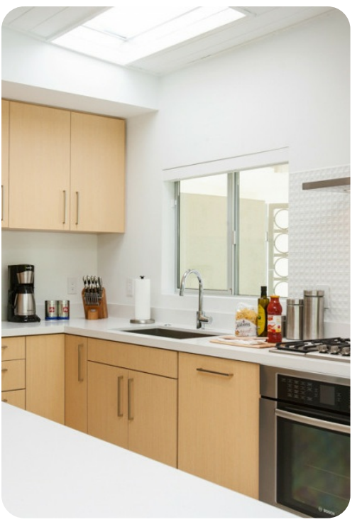
Palm Springs 23 | Page 4 of 8