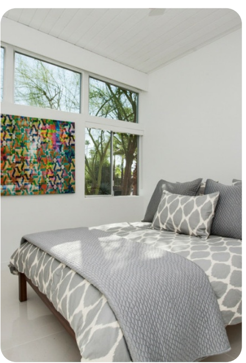
Palm Springs 23 | Page 8 of 8