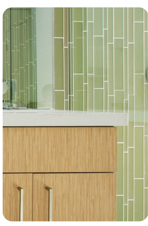
Palm Springs 23 | Page 6 of 8