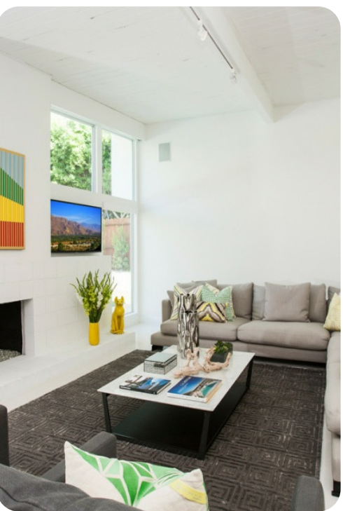
Palm Springs 23 | Page 2 of 8