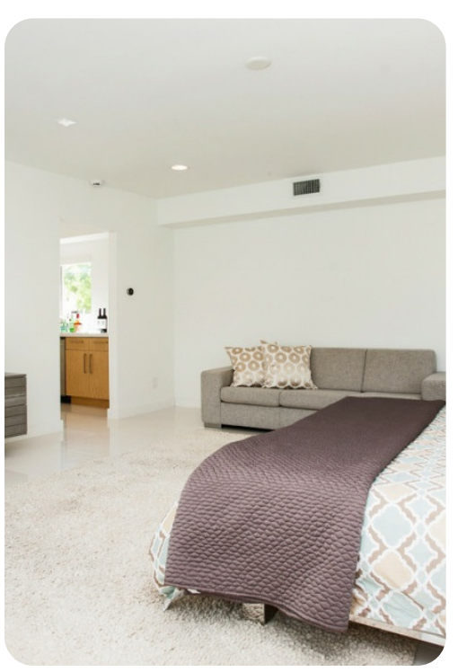
Palm Springs 23 | Page 5 of 8