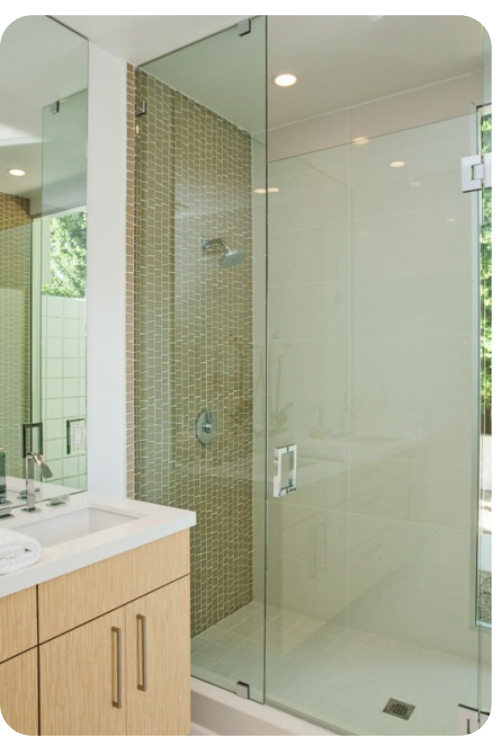
Palm Springs 23 | Page 7 of 8