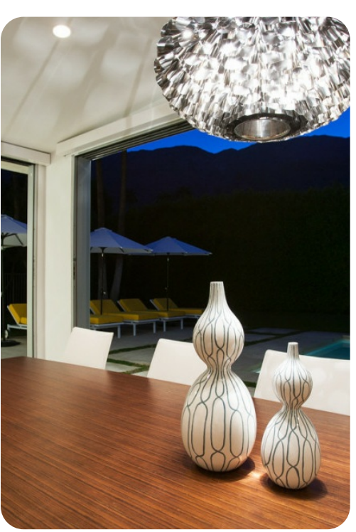
Palm Springs 23 | Page 3 of 8