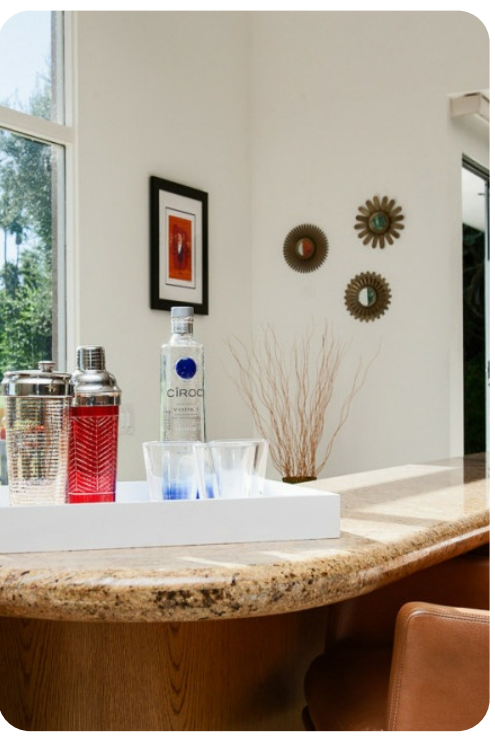
Palm Springs 21 | Page 8 of 8