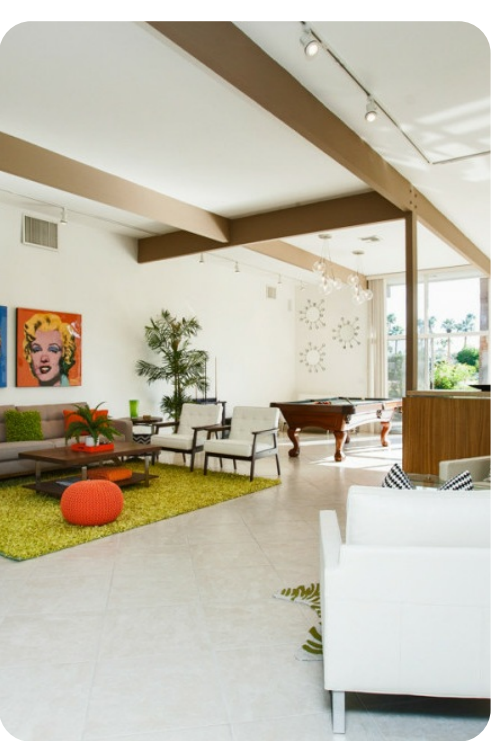
Palm Springs 21 | Page 2 of 8