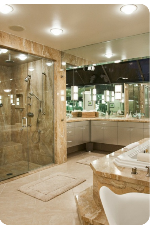
Palm Springs 21 | Page 5 of 8