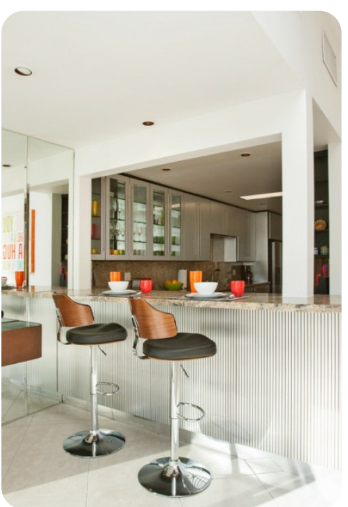
Palm Springs 21 | Page 3 of 8