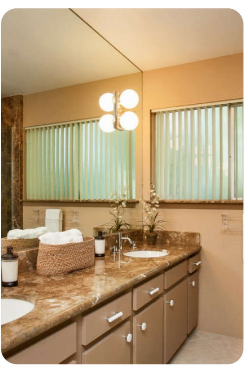
Palm Springs 21 | Page 6 of 8