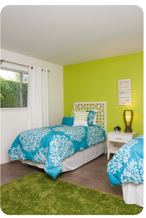
Palm Springs 21 | Page 7 of 8