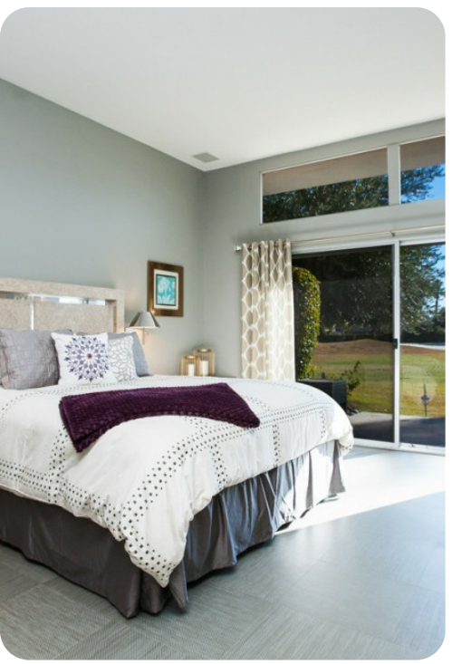
Palm Springs 21 | Page 4 of 8