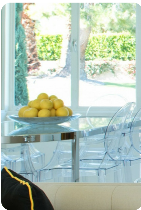
Palm Springs 18 | Page 2 of 8