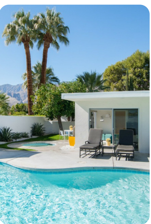
Palm Springs 18 | Page 7 of 8