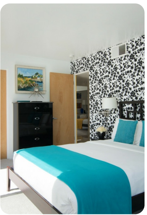
Palm Springs 18 | Page 6 of 8