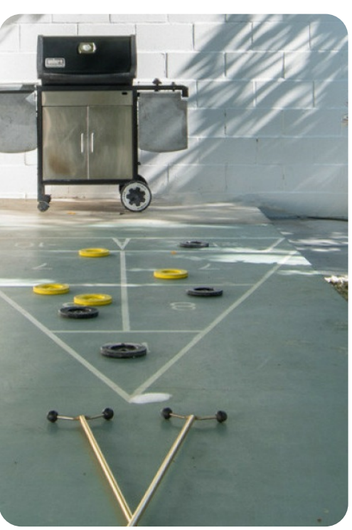
Palm Springs 18 | Page 8 of 8