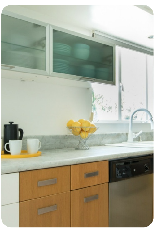
Palm Springs 18 | Page 3 of 8