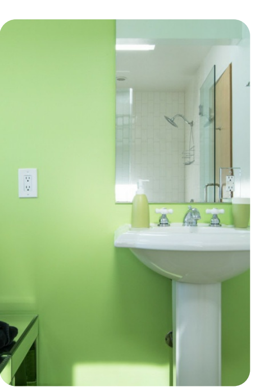
Palm Springs 18 | Page 4 of 8