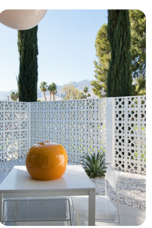
Palm Springs 18 | Page 5 of 8