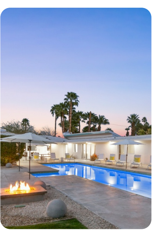
Palm Springs 11 | Page 4 of 8