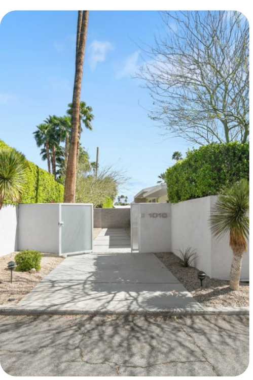
Palm Springs 11 | Page 5 of 8