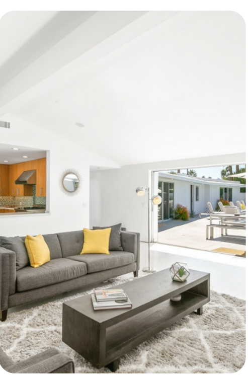
Palm Springs 11 | Page 7 of 8