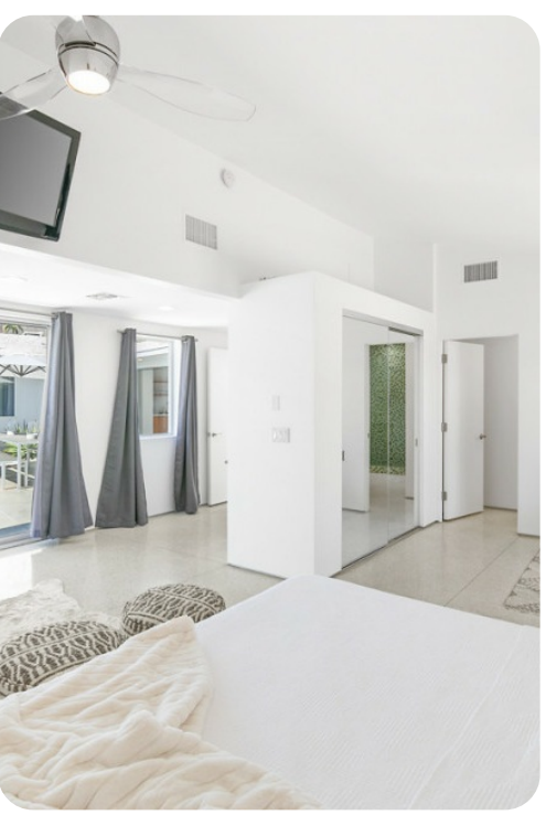
Palm Springs 11 | Page 6 of 8