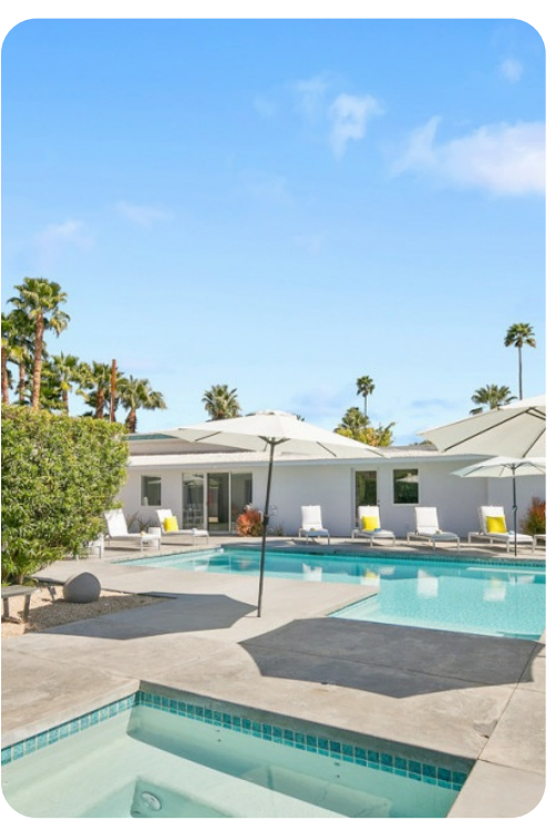
Palm Springs 11 | Page 3 of 8