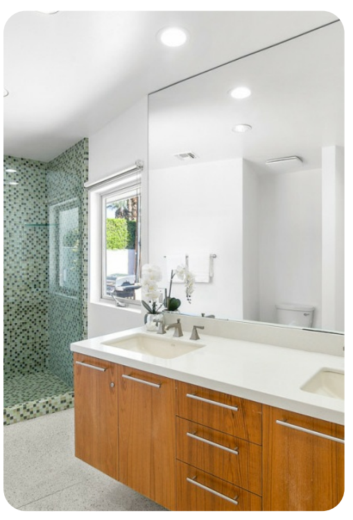
Palm Springs 11 | Page 8 of 8