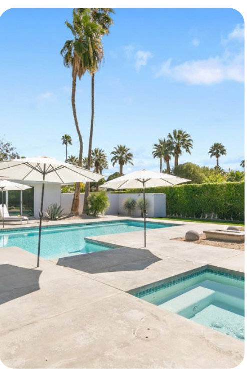
Palm Springs 11 | Page 2 of 8