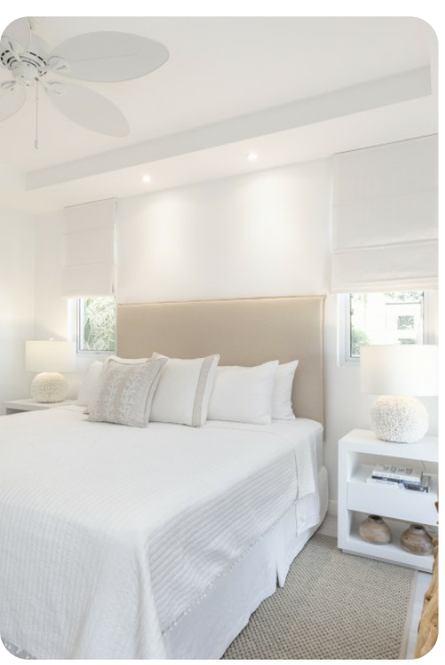
One Queens Street 4 | Page 5 of 7