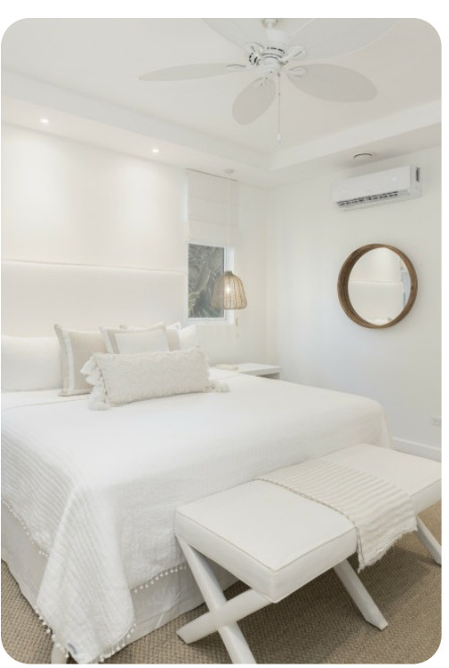
One Queens Street 4 | Page 4 of 7