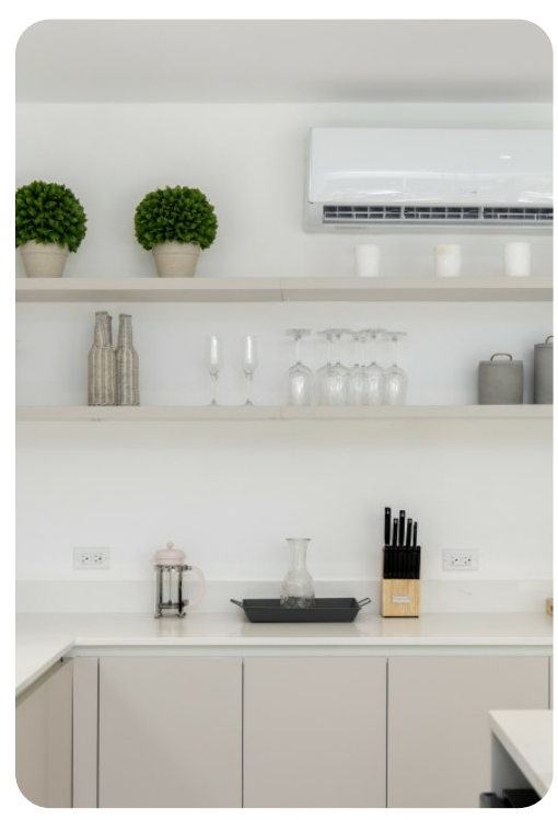
One Queens Street 4 | Page 3 of 7