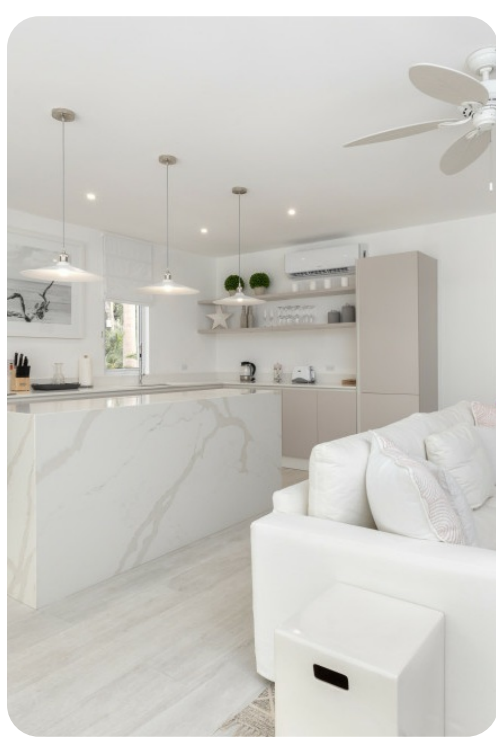
One Queens Street 4 | Page 2 of 7