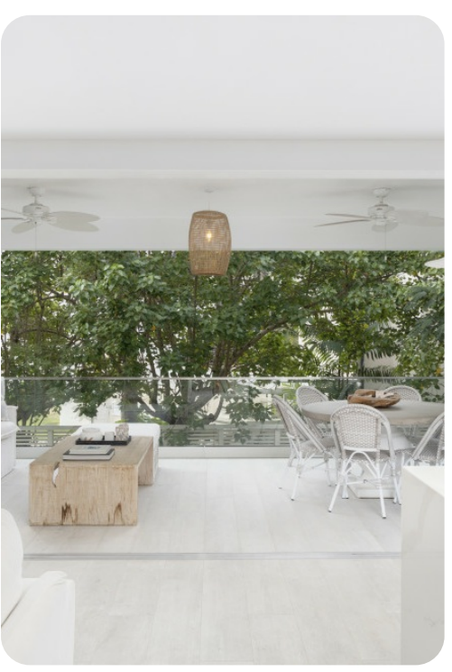
One Queens Street 4 | Page 6 of 7