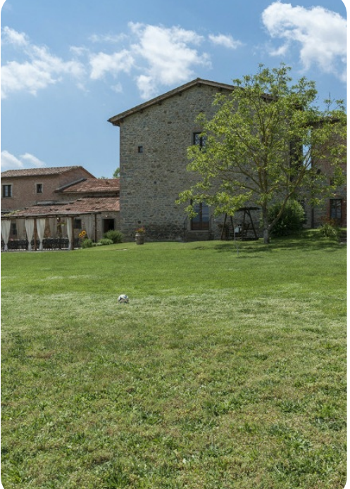
Nonno Fernando | Page 4 of 8