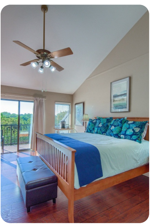
New Braunfels 20 | Page 5 of 8