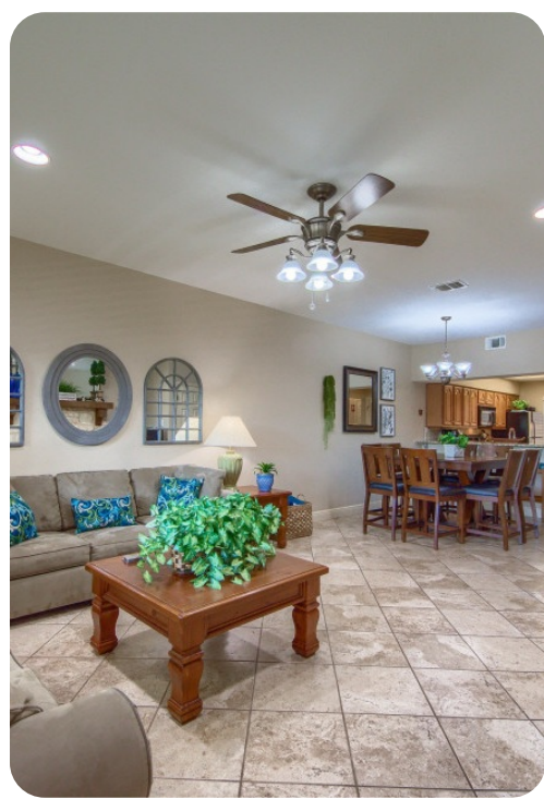
New Braunfels 20 | Page 2 of 8