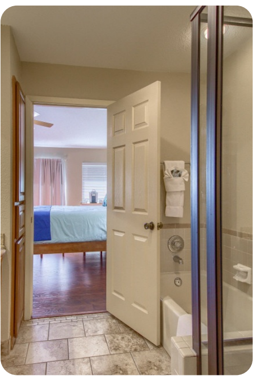
New Braunfels 20 | Page 6 of 8