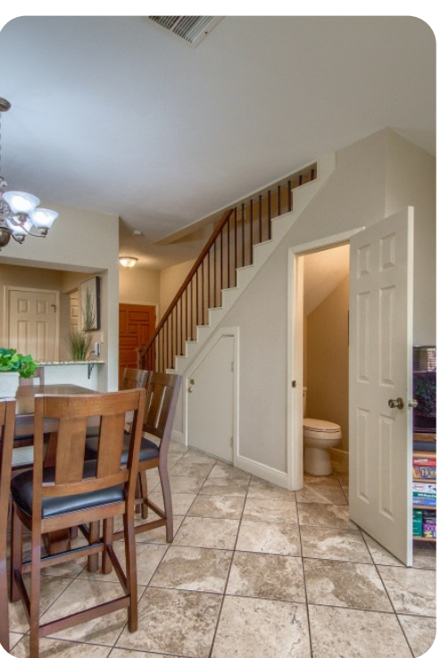
New Braunfels 20 | Page 3 of 8