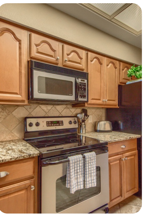
New Braunfels 20 | Page 4 of 8