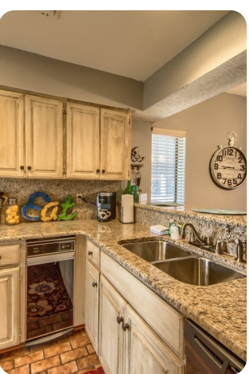
New Braunfels 12 | Page 2 of 8