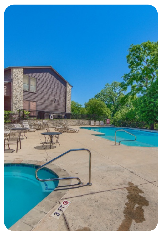
New Braunfels 12 | Page 6 of 8