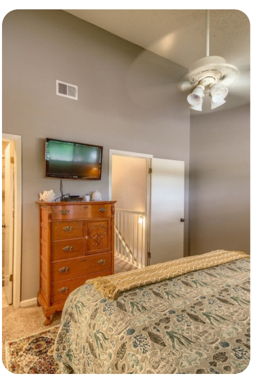
New Braunfels 12 | Page 5 of 8