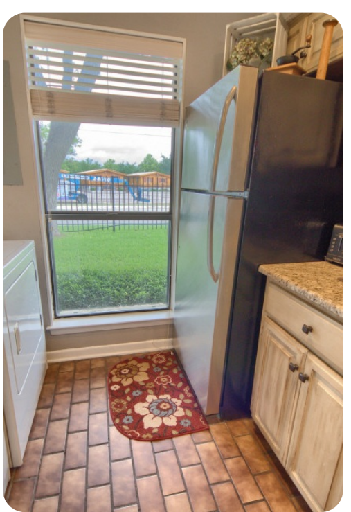
New Braunfels 12 | Page 3 of 8