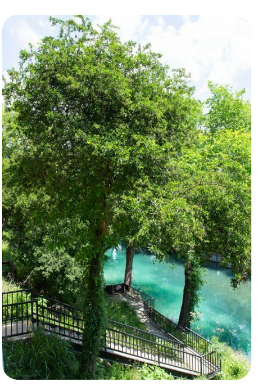
New Braunfels 12 | Page 7 of 8