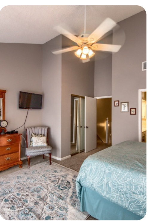
New Braunfels 12 | Page 4 of 8