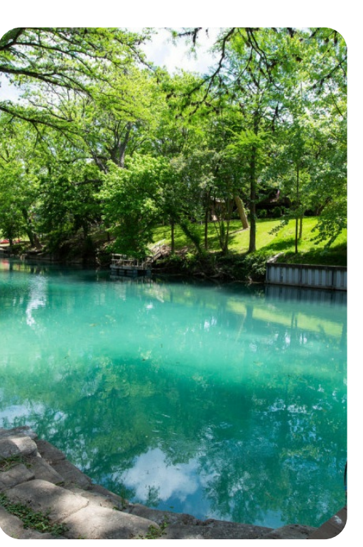
New Braunfels 12 | Page 8 of 8