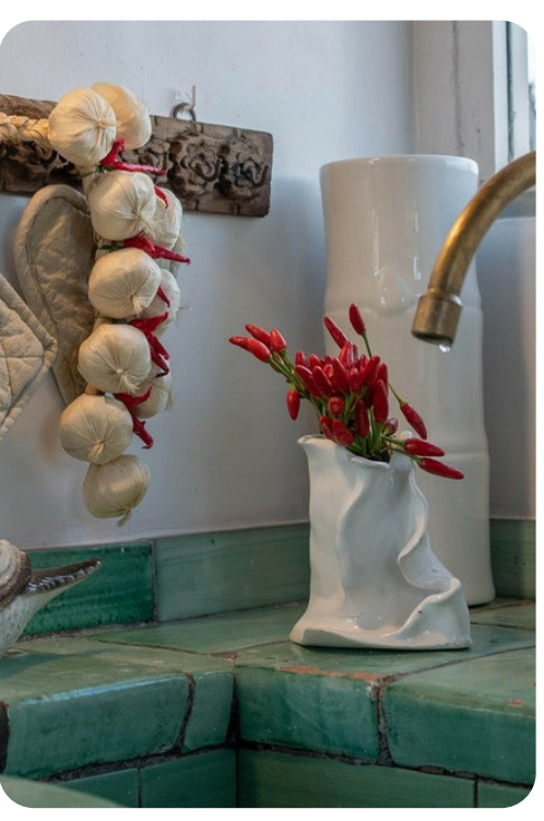
Nau | Page 3 of 6