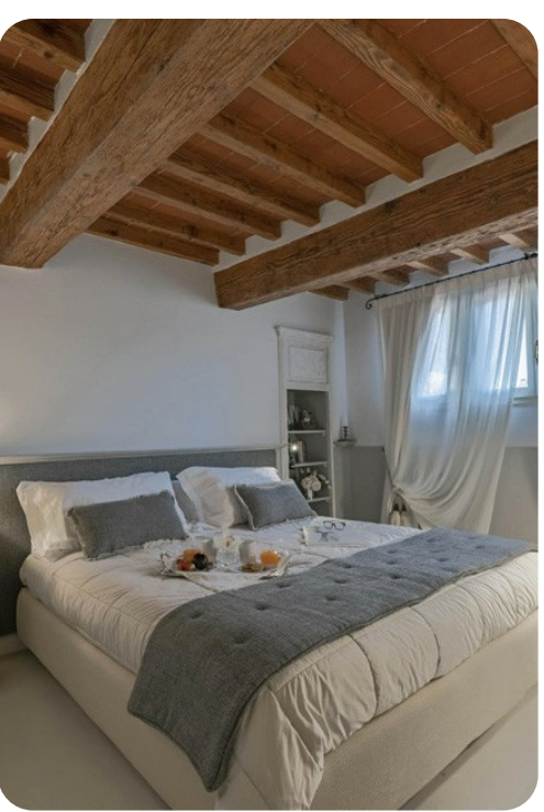
Nau | Page 4 of 6