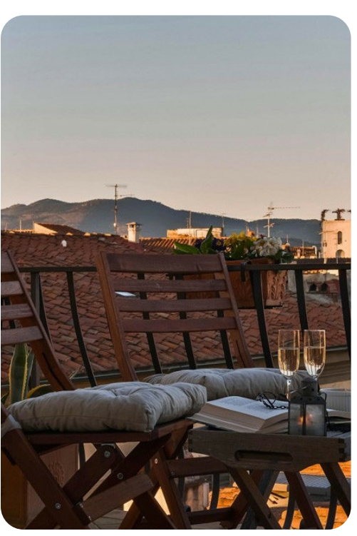
Nau | Page 5 of 6