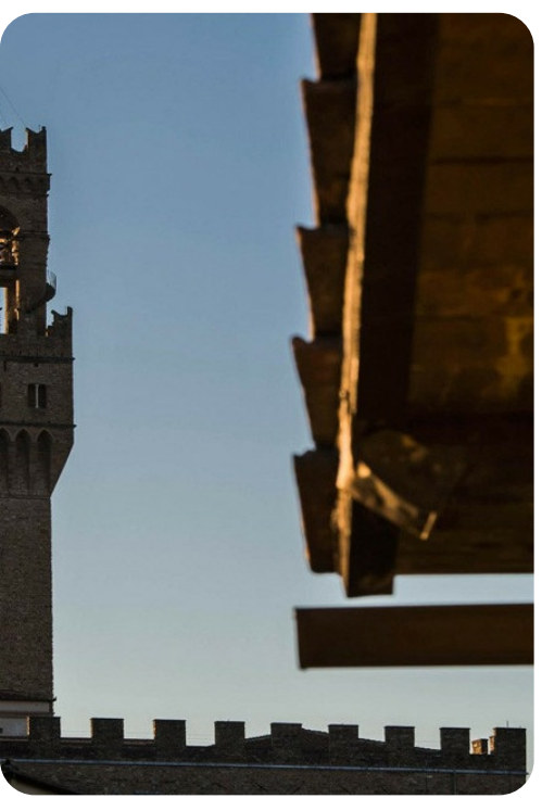
Nau | Page 6 of 6