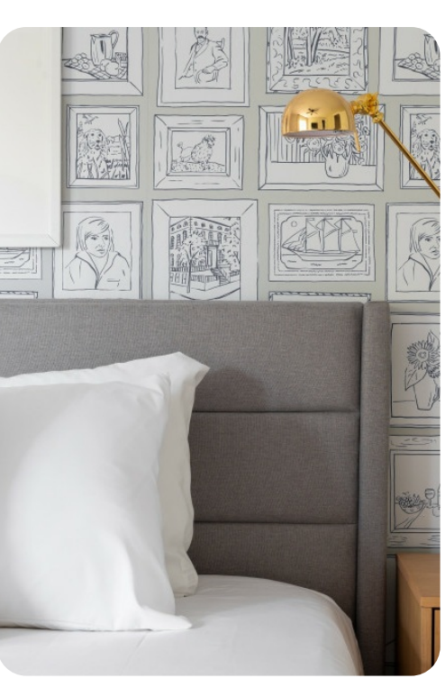
Nashville 150 | Page 4 of 6