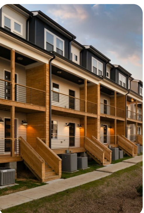
Nashville 150 | Page 6 of 6