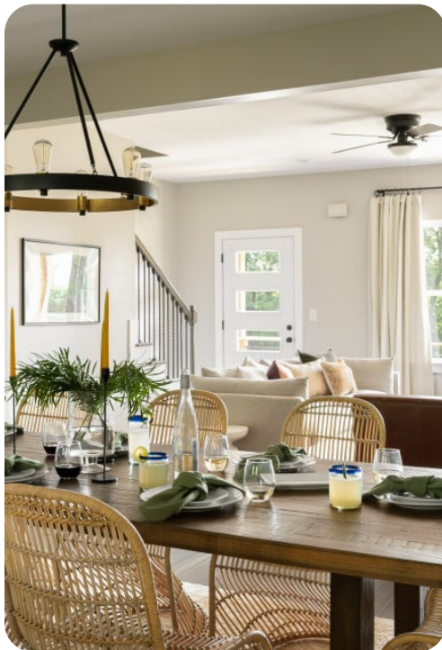
Nashville 150 | Page 3 of 6