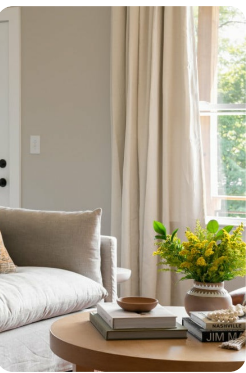
Nashville 150 | Page 2 of 6