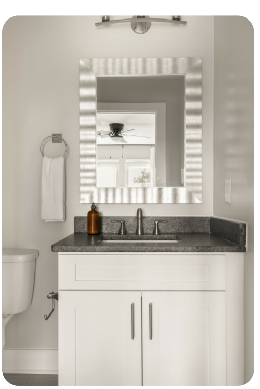
Nashville 150 | Page 5 of 6