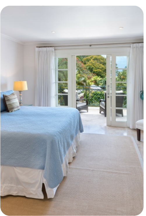
Mullins View 14 | Page 3 of 4