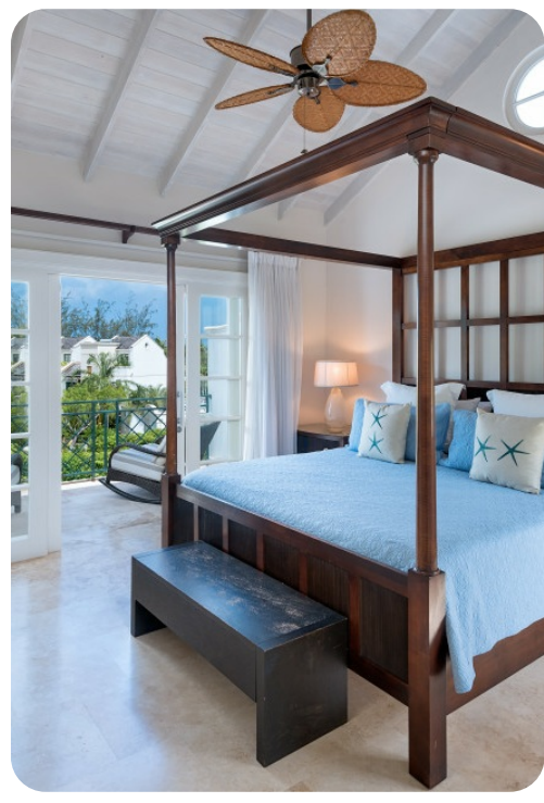
Mullins View 14 | Page 2 of 4