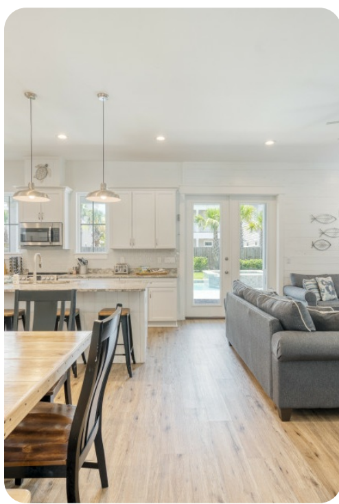
Miramar Beach 235 | Page 2 of 8