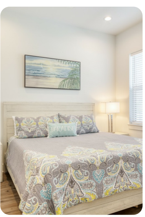
Miramar Beach 235 | Page 4 of 8