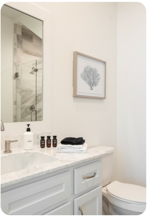
Miramar Beach 235 | Page 5 of 8