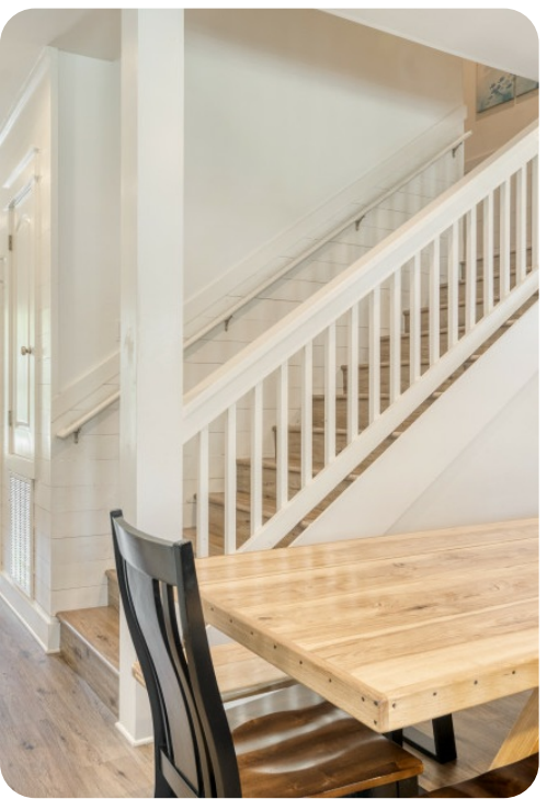
Miramar Beach 235 | Page 3 of 8