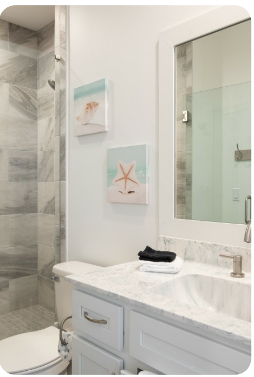
Miramar Beach 235 | Page 7 of 8