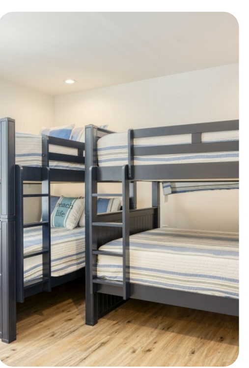
Miramar Beach 235 | Page 6 of 8