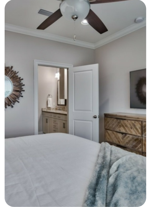
Miramar Beach 140 | Page 4 of 8