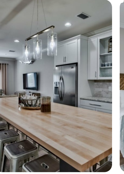
Miramar Beach 140 | Page 3 of 8