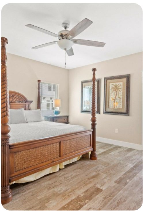
Miramar Beach 138 | Page 6 of 8