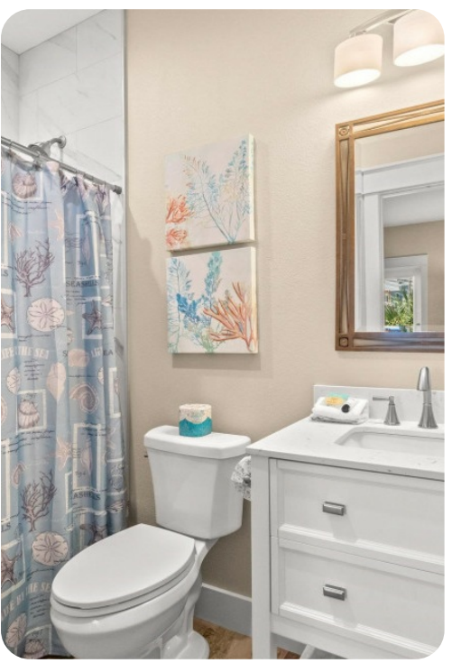
Miramar Beach 138 | Page 7 of 8