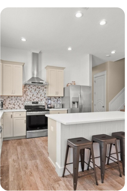
Miramar Beach 138 | Page 4 of 8