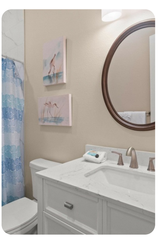
Miramar Beach 138 | Page 3 of 8