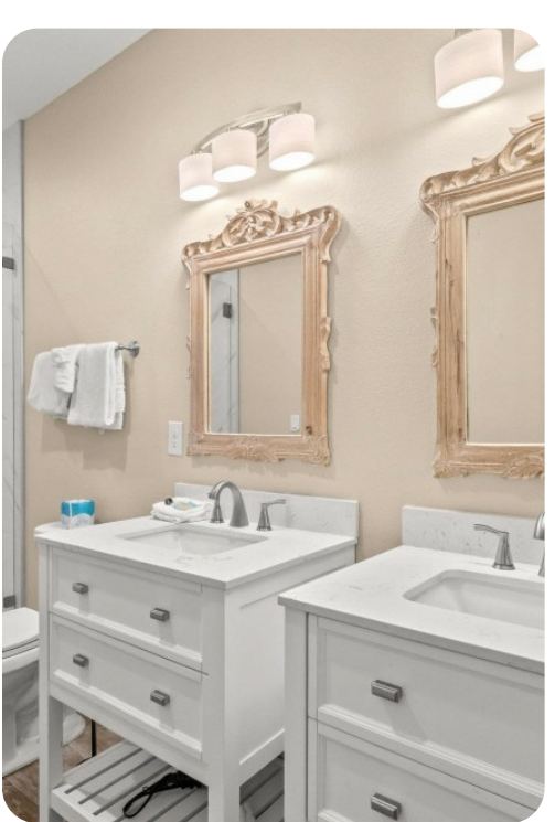
Miramar Beach 138 | Page 8 of 8