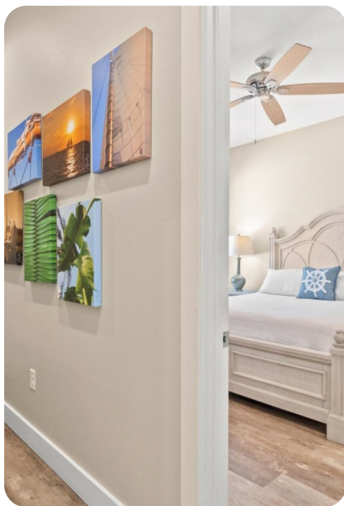
Miramar Beach 138 | Page 2 of 8