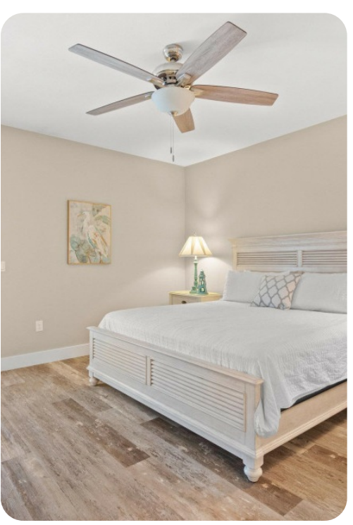
Miramar Beach 138 | Page 5 of 8