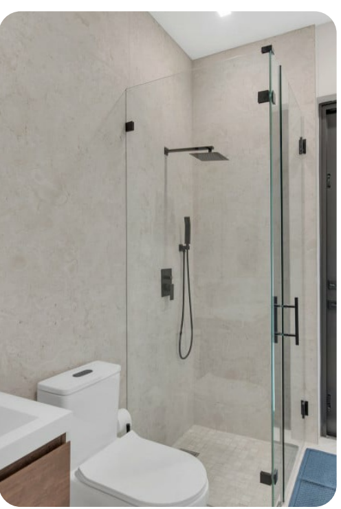
Miami 110 | Page 5 of 8