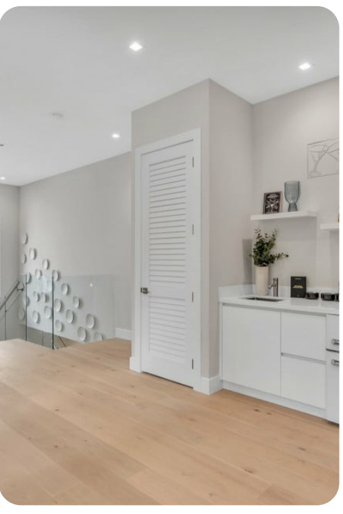
Miami 110 | Page 6 of 8