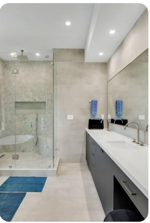
Miami 110 | Page 7 of 8