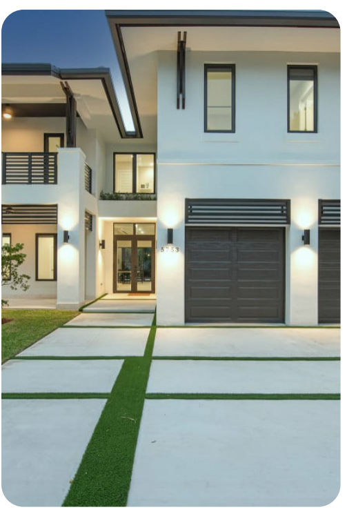
Miami 110 | Page 4 of 8