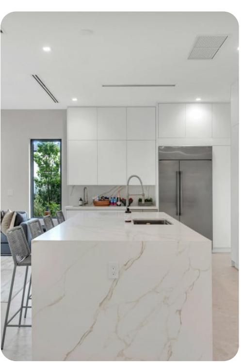
Miami 110 | Page 3 of 8