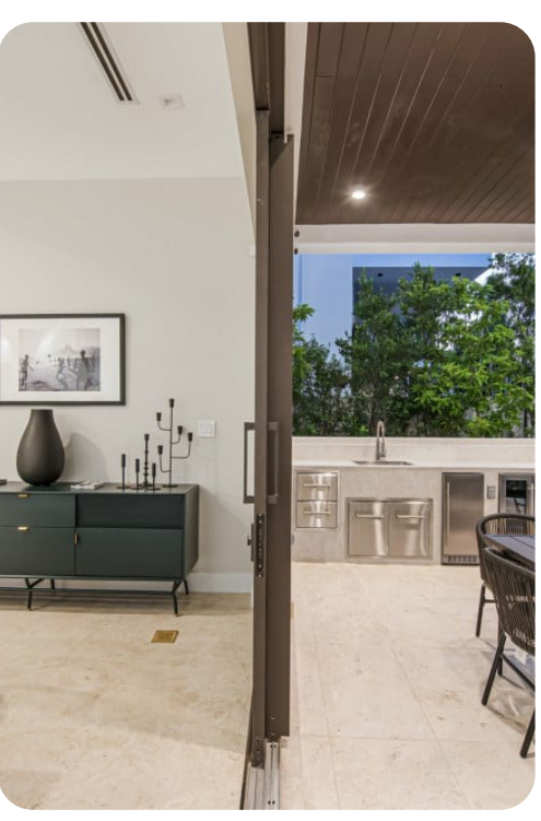
Miami 110 | Page 2 of 8