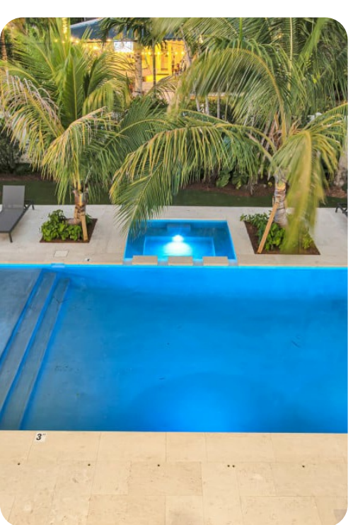
Miami 110 | Page 8 of 8