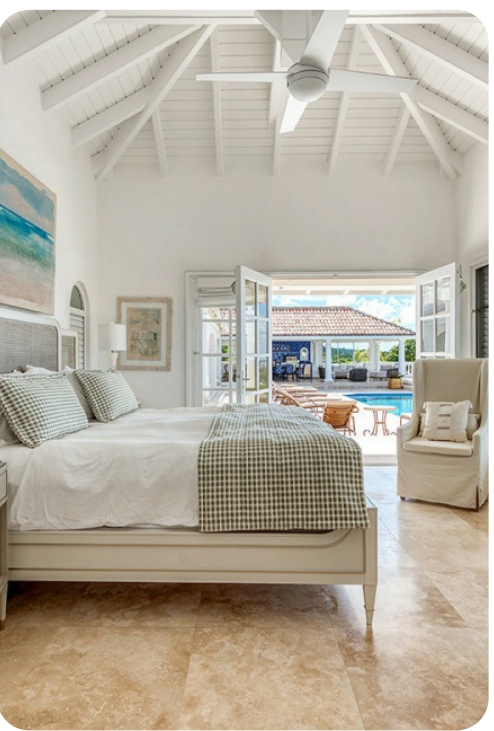
Mer Soleil | Page 6 of 8