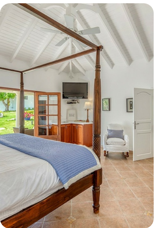
Mer Soleil | Page 5 of 8