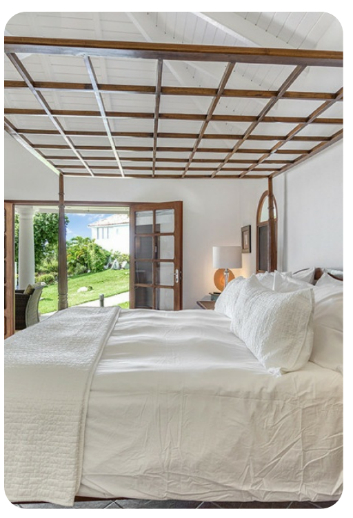
Mer Soleil | Page 4 of 8