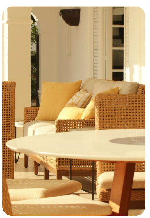
Mer Soleil | Page 8 of 8