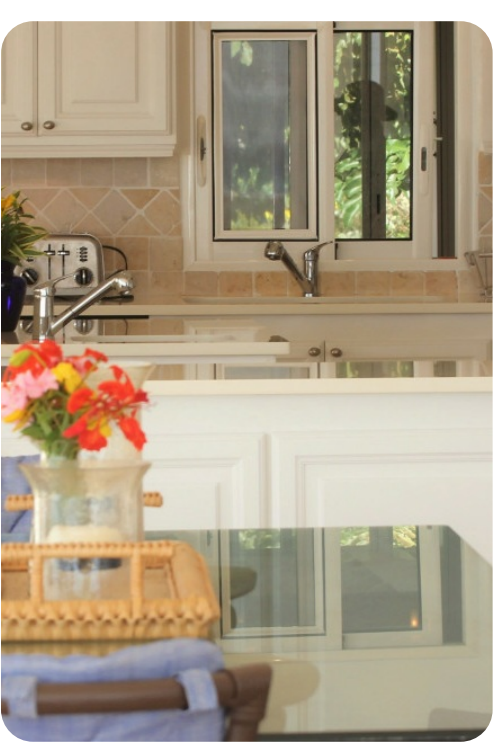
Mer Soleil | Page 7 of 8