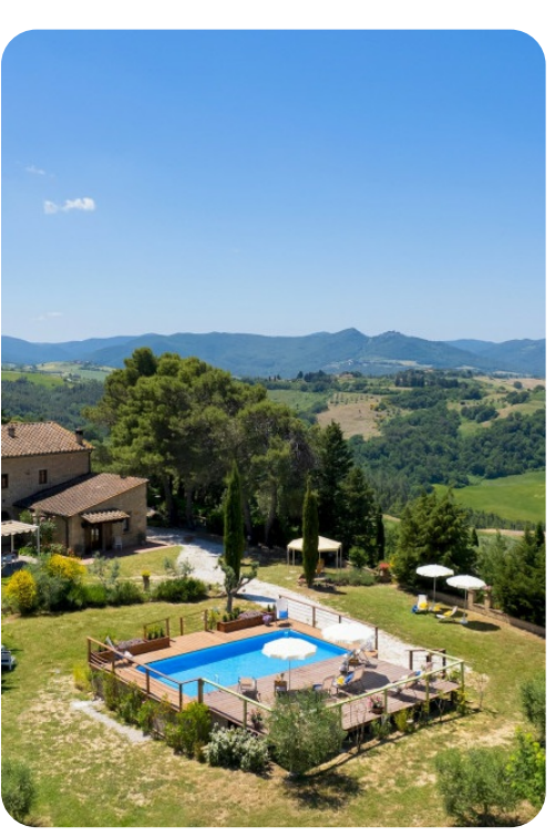
Masso delle Fanciulle | Page 3 of 8