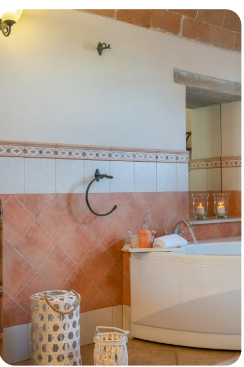
Masso delle Fanciulle | Page 8 of 8