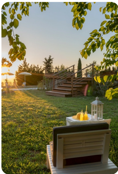
Masso delle Fanciulle | Page 2 of 8