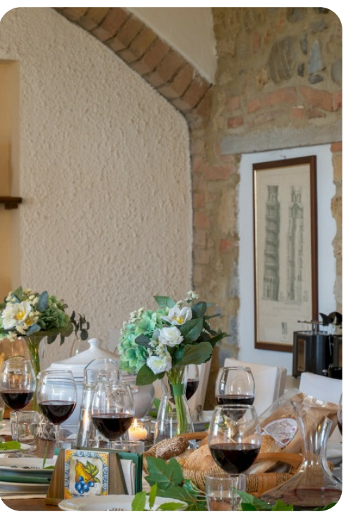
Masso delle Fanciulle | Page 7 of 8