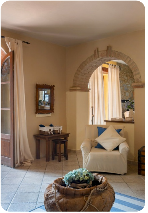
Masso delle Fanciulle | Page 6 of 8