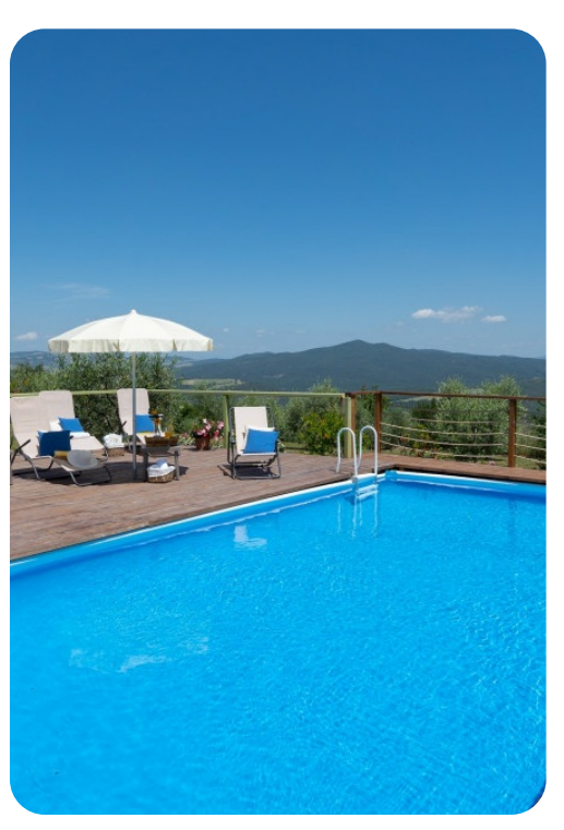
Masso delle Fanciulle | Page 5 of 8