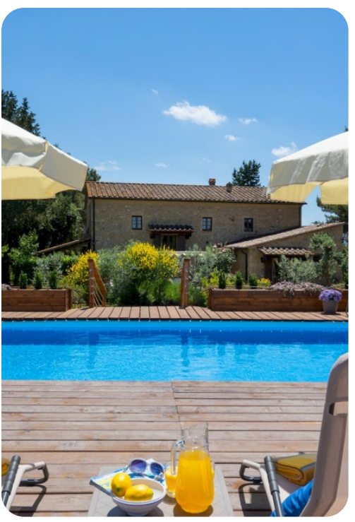
Masso delle Fanciulle | Page 4 of 8