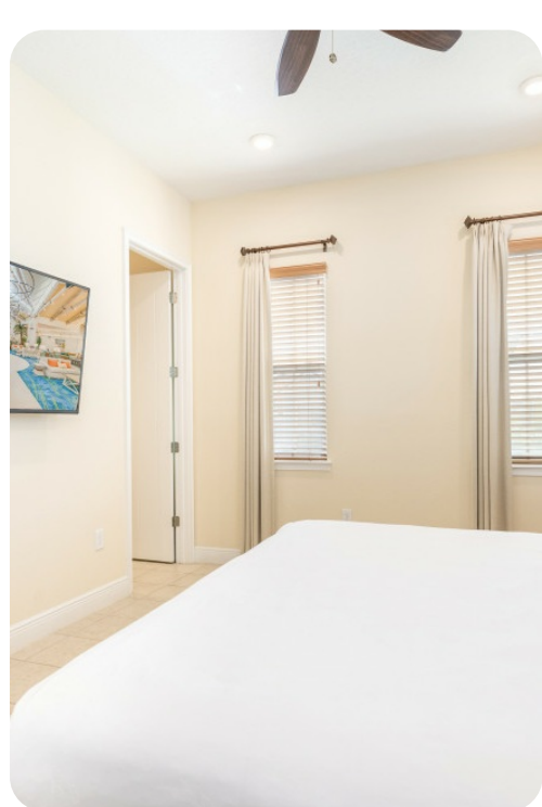
Margaritaville 238 | Page 3 of 4