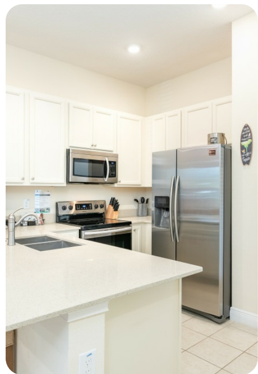
Margaritaville 238 | Page 2 of 4