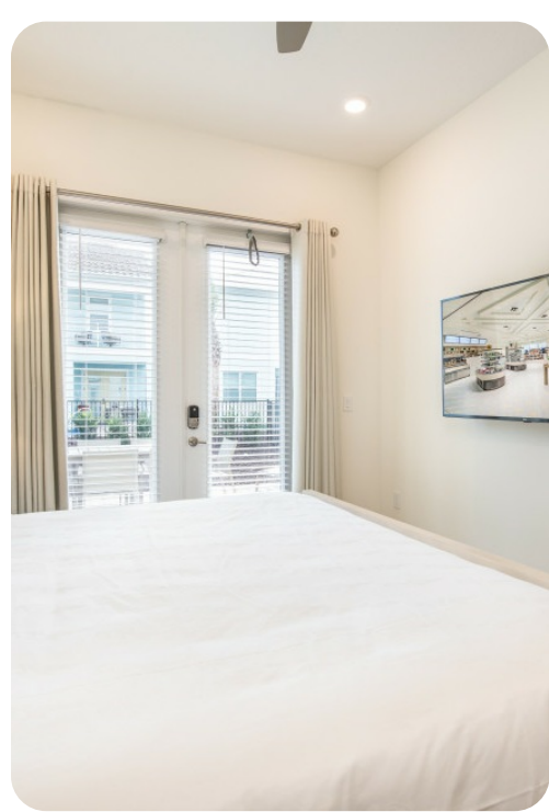
Margaritaville 190 | Page 3 of 6