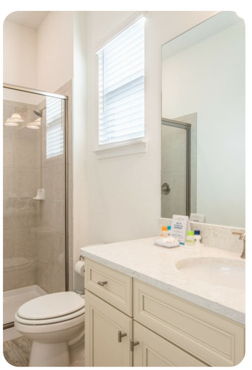
Margaritaville 190 | Page 4 of 6