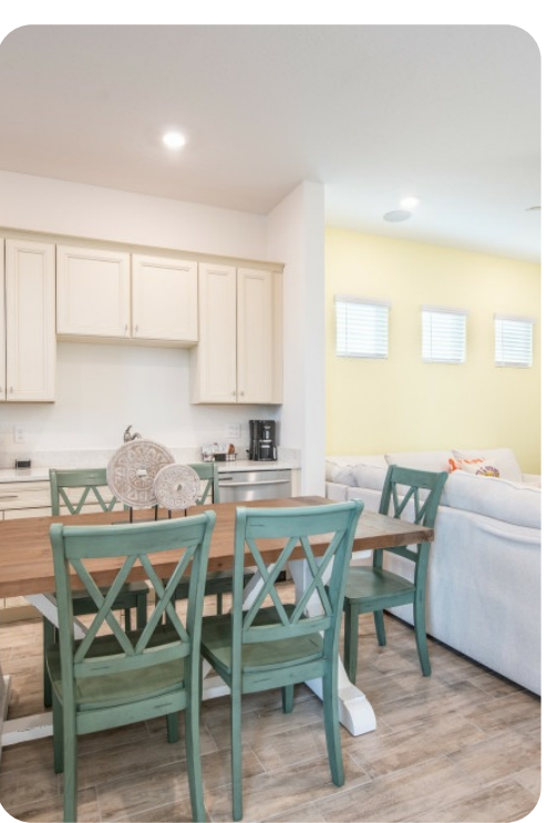
Margaritaville 190 | Page 2 of 6