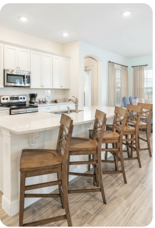
Margaritaville 108 | Page 7 of 8