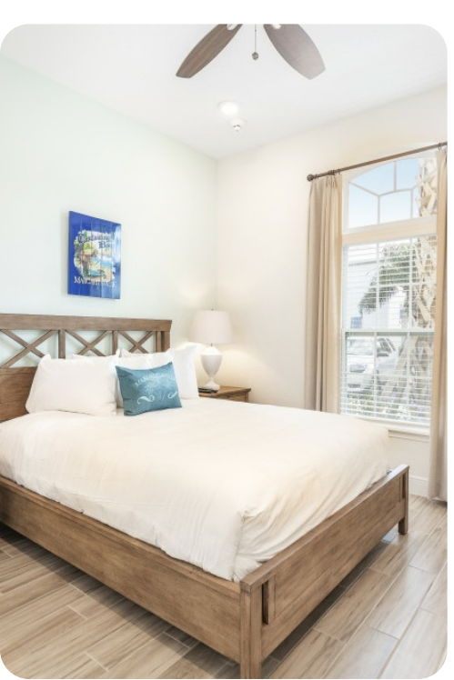
Margaritaville 108 | Page 5 of 8