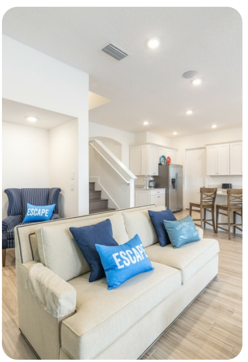
Margaritaville 108 | Page 6 of 8