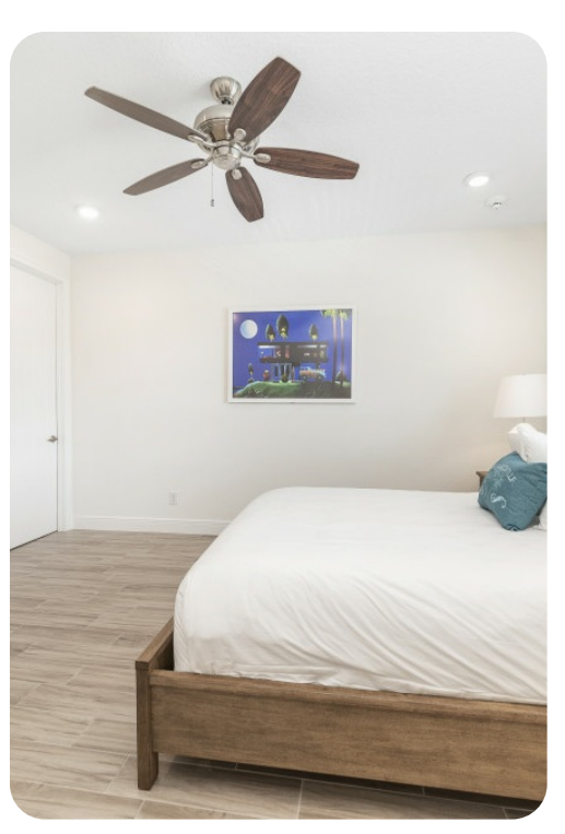
Margaritaville 108 | Page 4 of 8