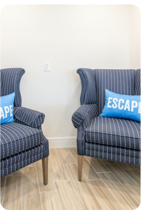
Margaritaville 108 | Page 8 of 8