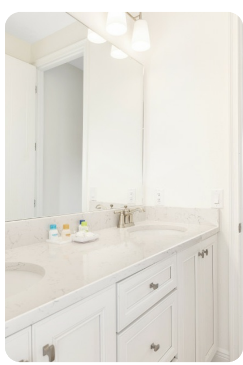
Margaritaville 108 | Page 3 of 8