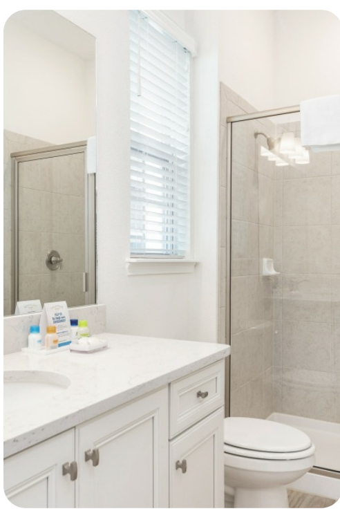
Margaritaville 108 | Page 2 of 8