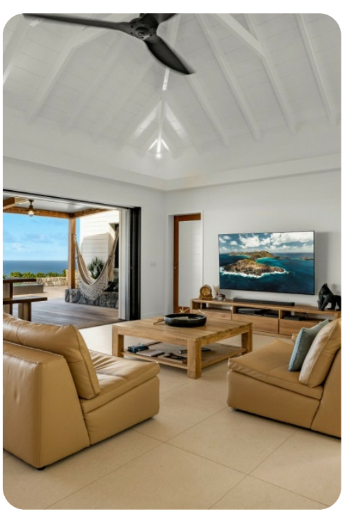
Mao | Page 2 of 8