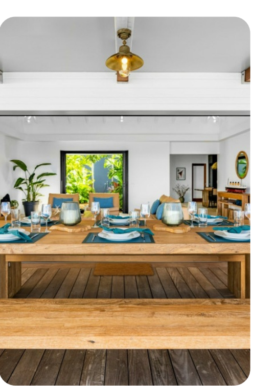
Mao | Page 3 of 8