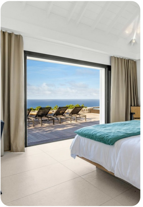
Mao | Page 5 of 8