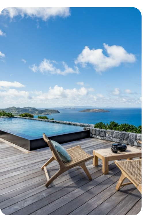
Mao | Page 8 of 8