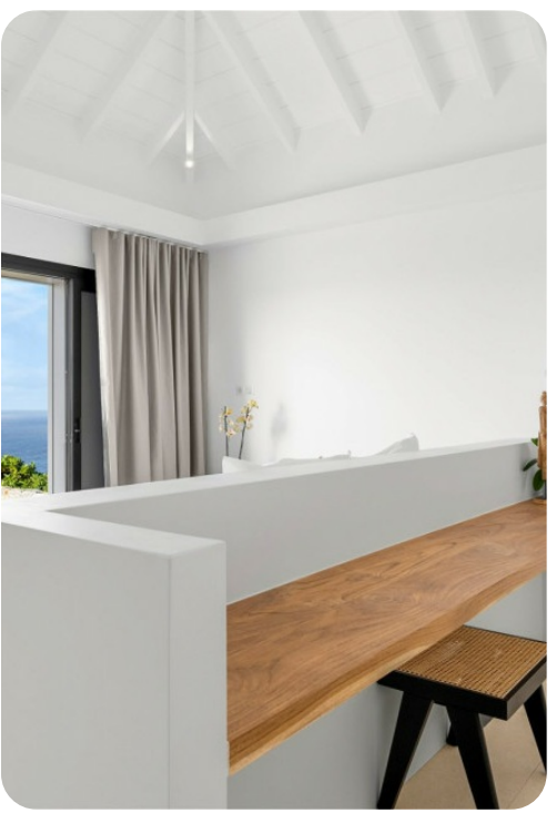
Mao | Page 7 of 8