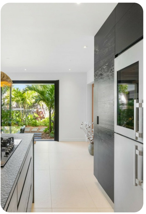
Mao | Page 4 of 8