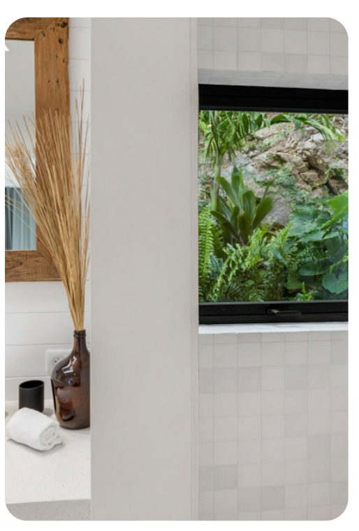
Mao | Page 6 of 8