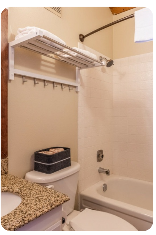
Mammoth Lakes 97 | Page 6 of 8