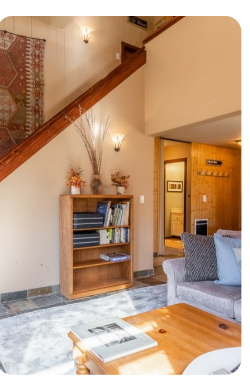
Mammoth Lakes 97 | Page 4 of 8