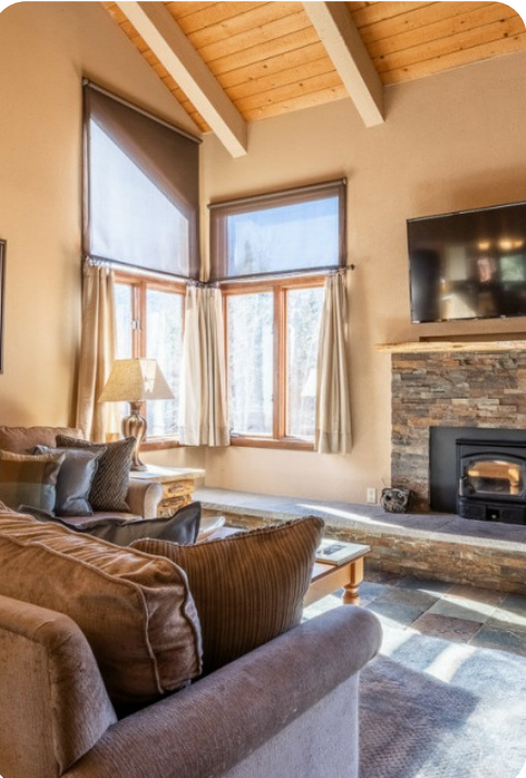
Mammoth Lakes 97 | Page 2 of 8