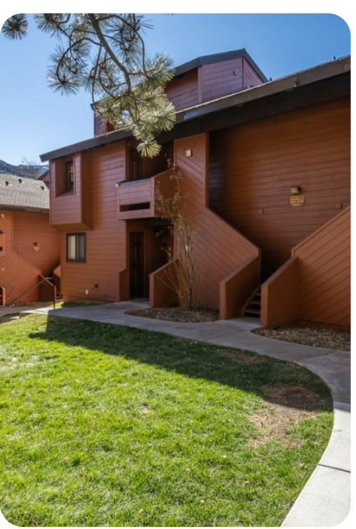
Mammoth Lakes 97 | Page 8 of 8