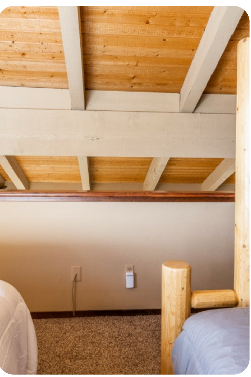
Mammoth Lakes 97 | Page 7 of 8