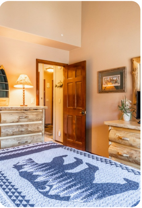
Mammoth Lakes 97 | Page 5 of 8