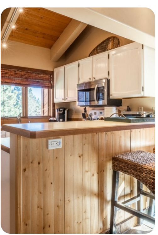
Mammoth Lakes 97 | Page 3 of 8