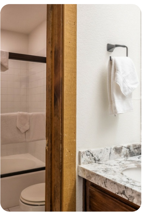
Mammoth Lakes 78 | Page 7 of 8