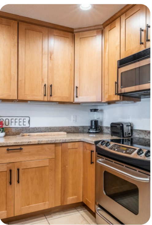
Mammoth Lakes 78 | Page 5 of 8