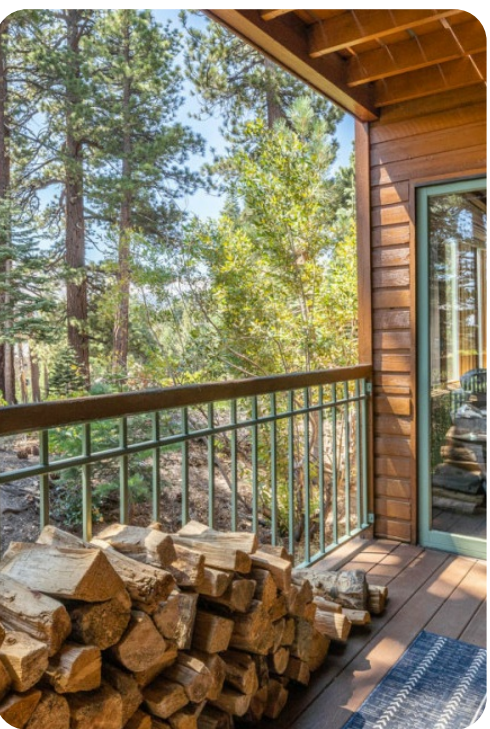
Mammoth Lakes 78 | Page 2 of 8