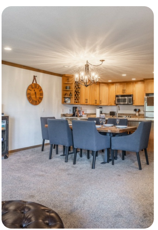
Mammoth Lakes 78 | Page 4 of 8