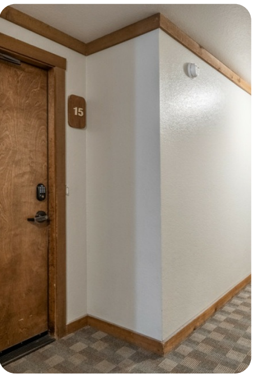
Mammoth Lakes 78 | Page 8 of 8