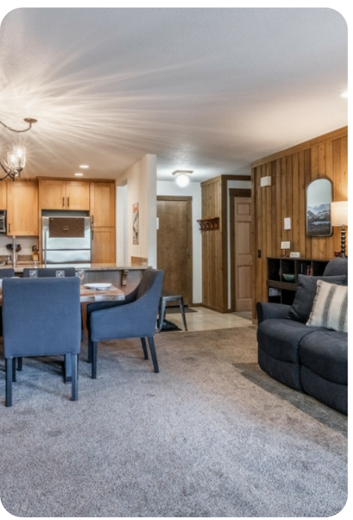
Mammoth Lakes 78 | Page 3 of 8