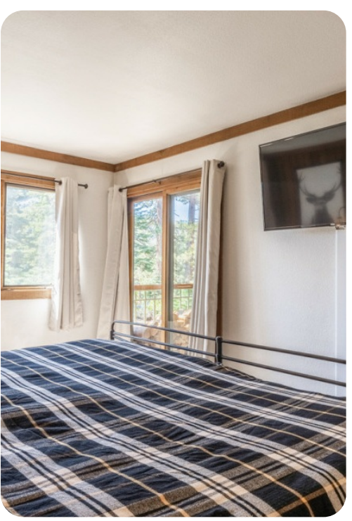
Mammoth Lakes 78 | Page 6 of 8