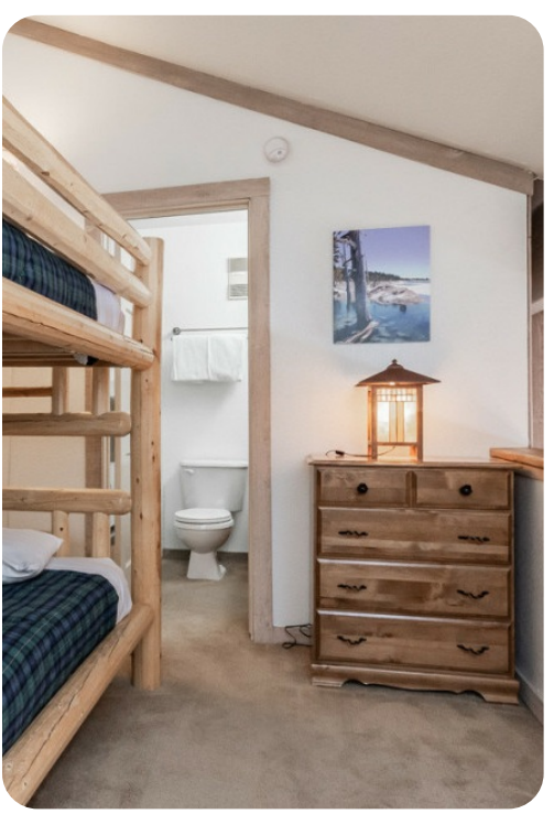
Mammoth Lakes 75 | Page 6 of 8