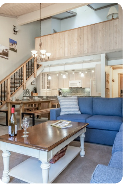
Mammoth Lakes 75 | Page 2 of 8