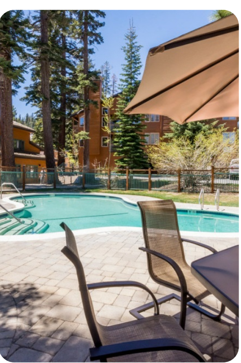
Mammoth Lakes 75 | Page 7 of 8