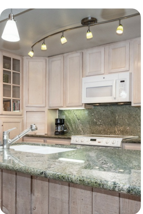
Mammoth Lakes 75 | Page 3 of 8