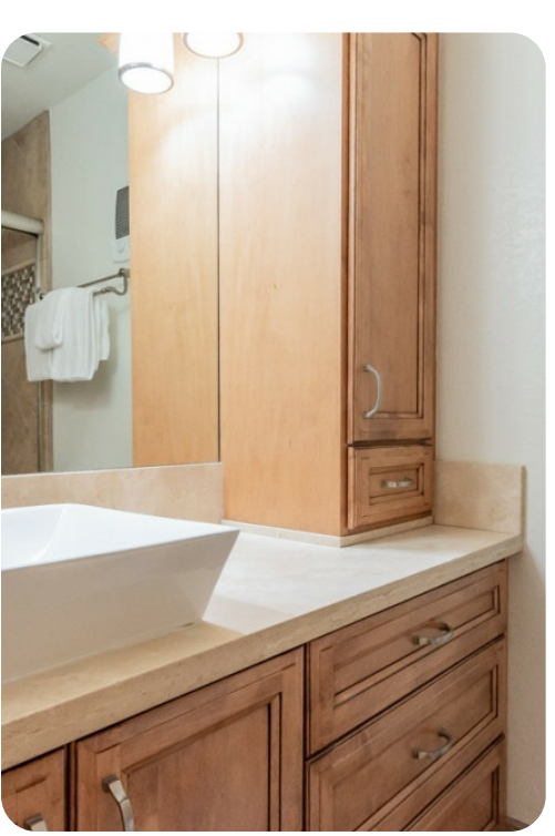
Mammoth Lakes 75 | Page 5 of 8