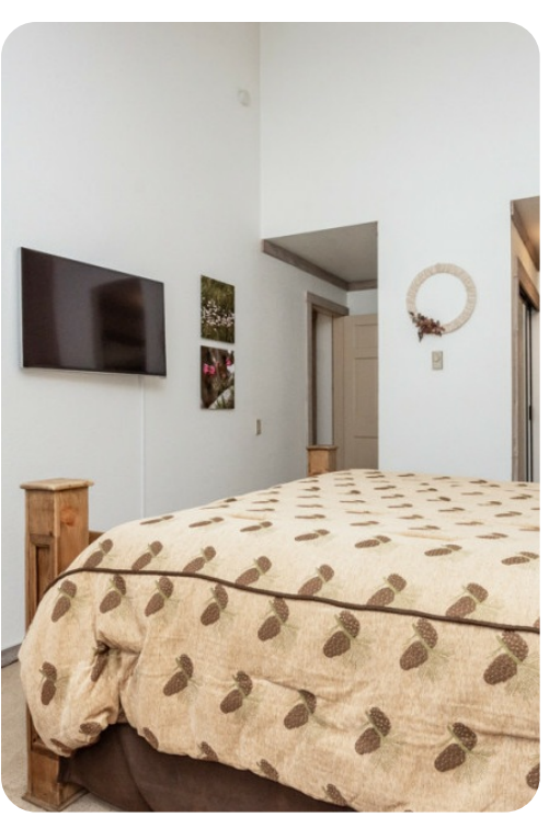
Mammoth Lakes 75 | Page 4 of 8