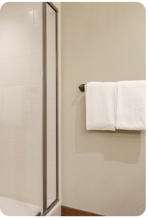
Mammoth Lakes 72 | Page 5 of 8