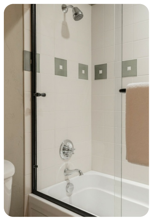
Mammoth Lakes 72 | Page 7 of 8