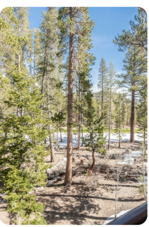
Mammoth Lakes 72 | Page 8 of 8