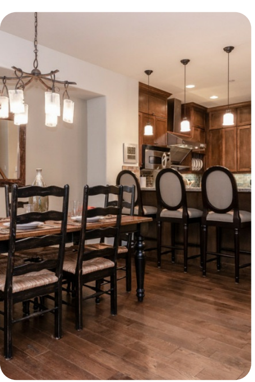
Mammoth Lakes 72 | Page 3 of 8