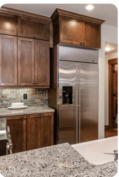
Mammoth Lakes 72 | Page 4 of 8