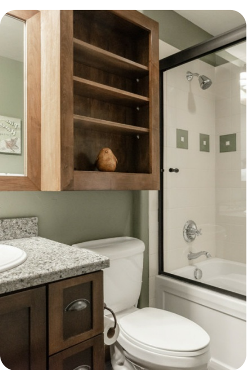
Mammoth Lakes 72 | Page 6 of 8