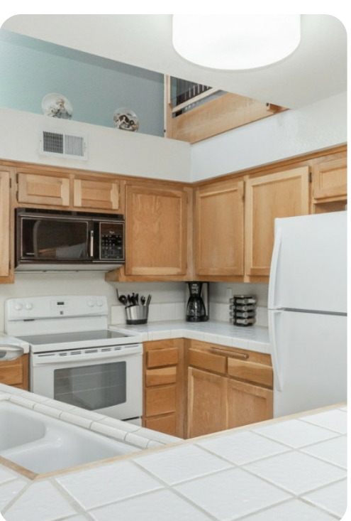
Mammoth Lakes 63 | Page 4 of 7