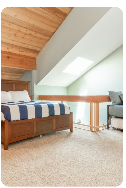
Mammoth Lakes 63 | Page 6 of 7