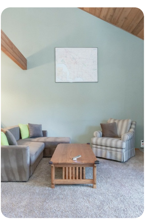
Mammoth Lakes 63 | Page 2 of 7