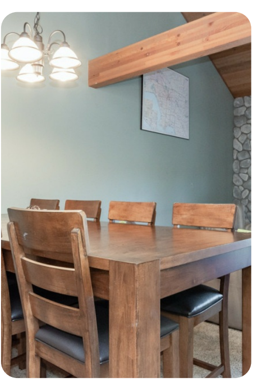
Mammoth Lakes 63 | Page 3 of 7