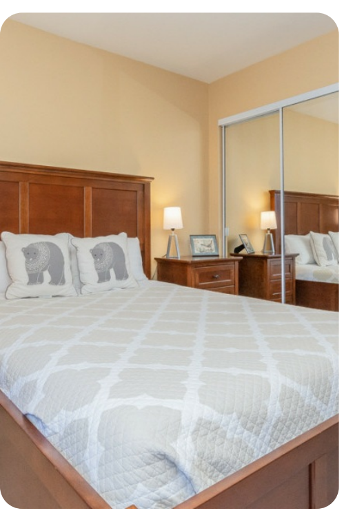
Mammoth Lakes 63 | Page 5 of 7 \,