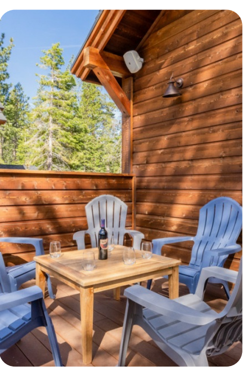
Mammoth Lakes 60 | Page 8 of 8