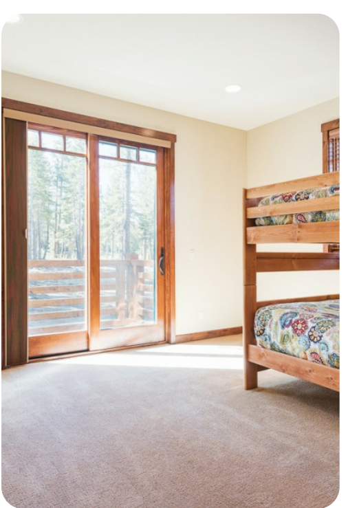
Mammoth Lakes 60 | Page 6 of 8