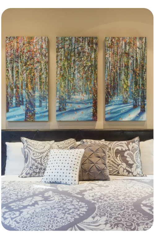
Mammoth Lakes 60 | Page 4 of 8