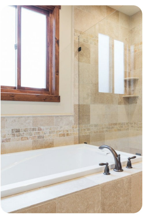
Mammoth Lakes 60 | Page 5 of 8