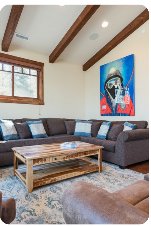
Mammoth Lakes 60 | Page 2 of 8