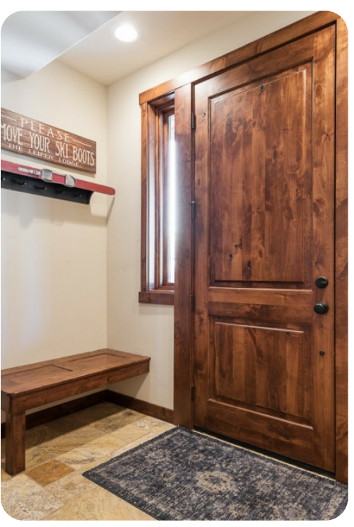
Mammoth Lakes 60 | Page 7 of 8