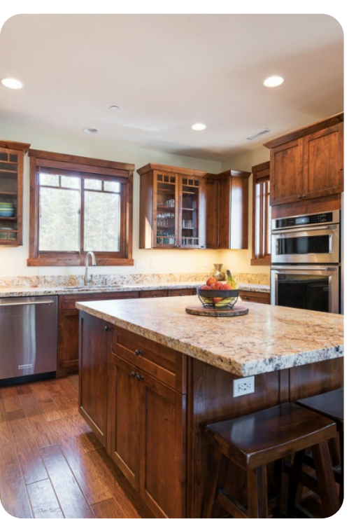
Mammoth Lakes 60 | Page 3 of 8