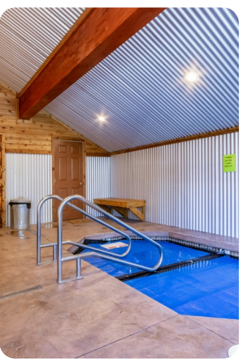
Mammoth Lakes 53 | Page 5 of 6