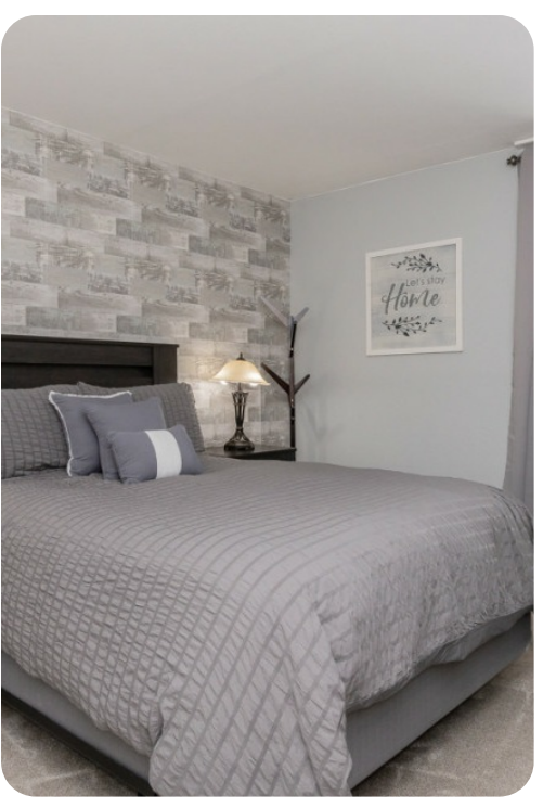
Mammoth Lakes 53 | Page 4 of 6