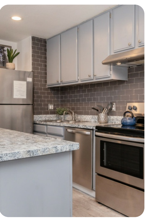
Mammoth Lakes 53 | Page 3 of 6 \,