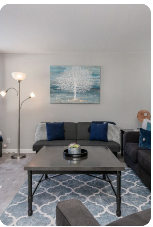
Mammoth Lakes 53 | Page 2 of 6