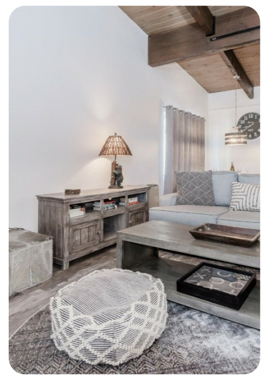
Mammoth Lakes 3 | Page 2 of 8