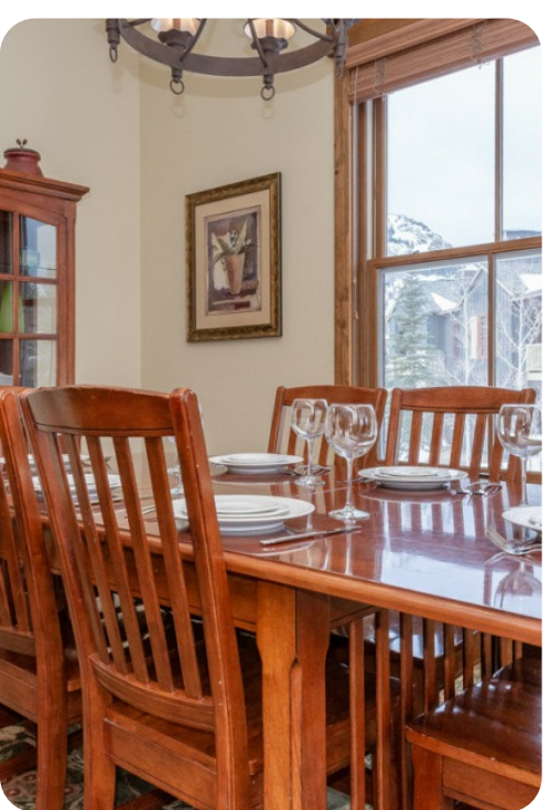
Mammoth Lakes 26 | Page 3 of 8