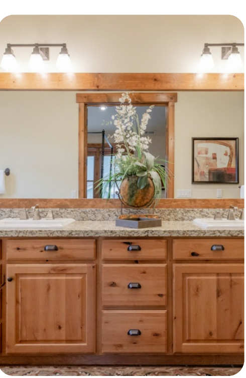
Mammoth Lakes 26 | Page 5 of 8