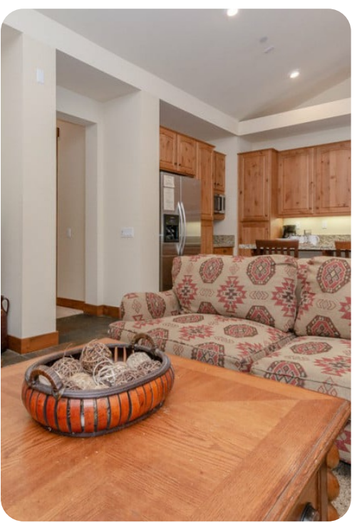
Mammoth Lakes 26 | Page 2 of 8