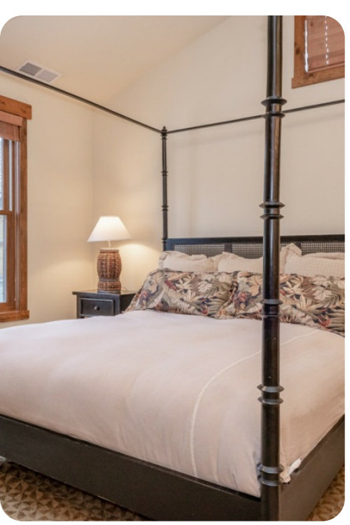
Mammoth Lakes 26 | Page 4 of 8