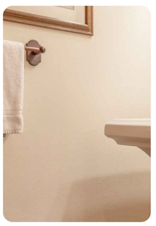
Mammoth Lakes 26 | Page 7 of 8