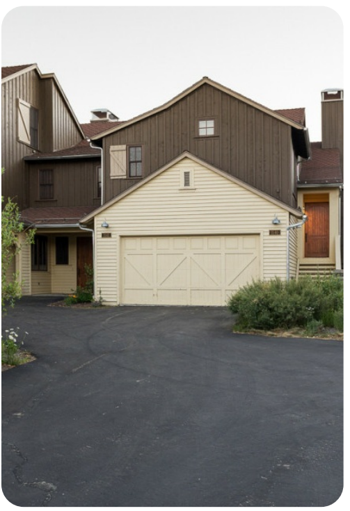
Mammoth Lakes 26 | Page 8 of 8