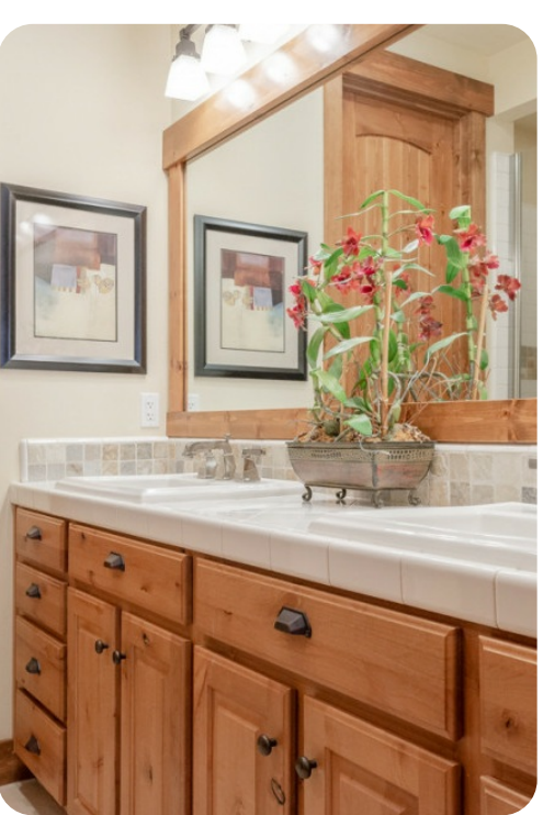
Mammoth Lakes 26 | Page 6 of 8