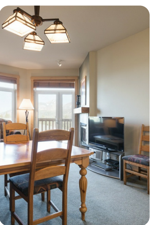
Mammoth Lakes 13 | Page 2 of 7