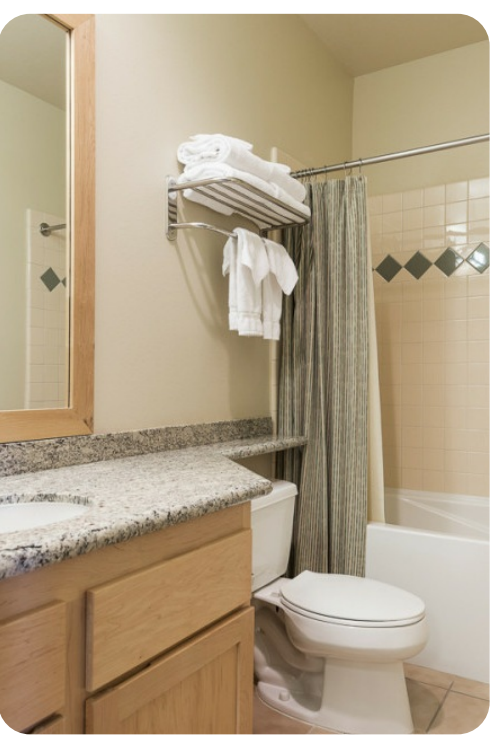
Mammoth Lakes 13 | Page 6 of 7