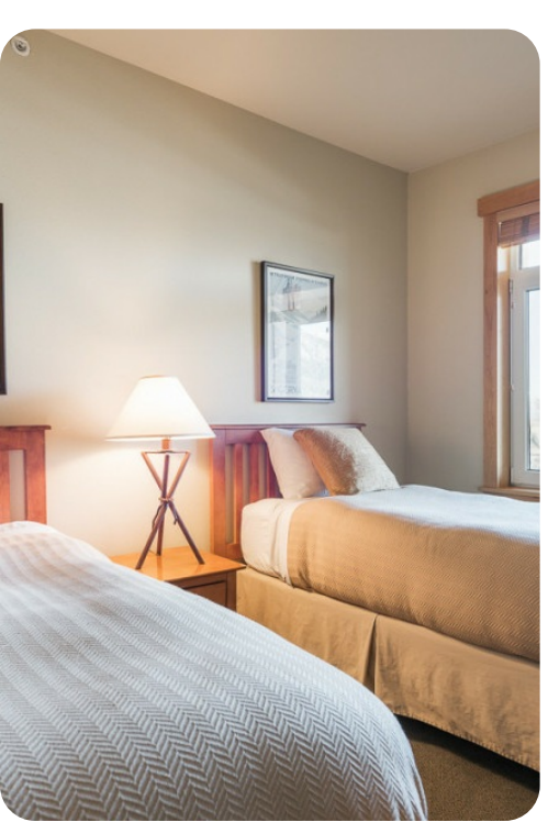
Mammoth Lakes 13 | Page 5 of 7