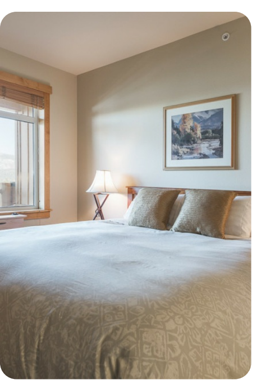
Mammoth Lakes 13 | Page 4 of 7