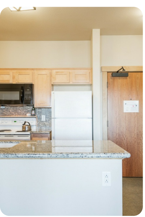
Mammoth Lakes 13 | Page 3 of 7