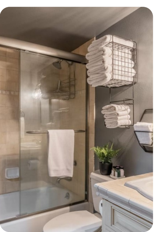
Mammoth Lakes 113 | Page 6 of 8