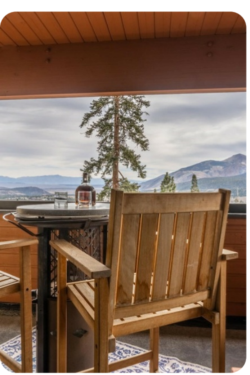
Mammoth Lakes 113 | Page 7 of 8