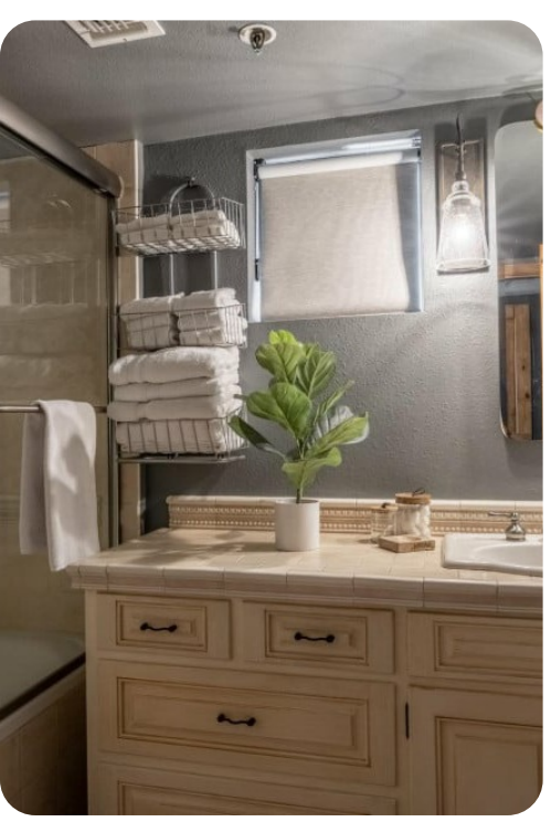
Mammoth Lakes 113 | Page 5 of 8