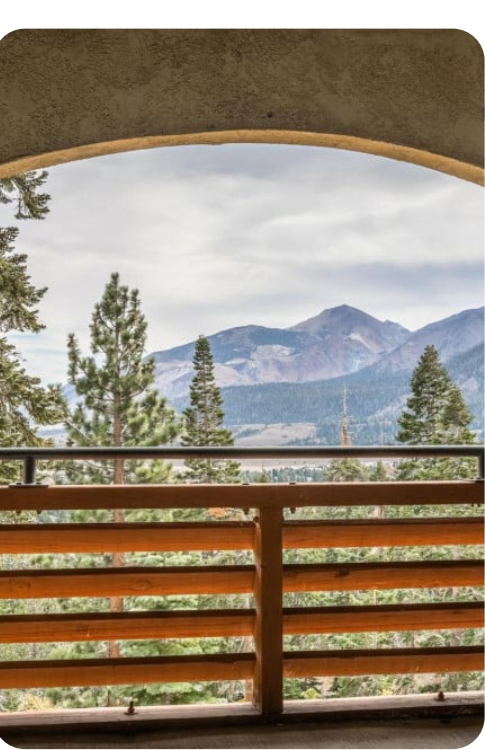
Mammoth Lakes 113 | Page 8 of 8