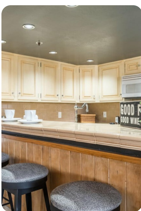
Mammoth Lakes 113 | Page 2 of 8