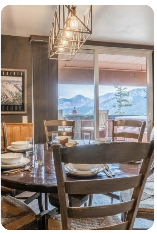
Mammoth Lakes 113 | Page 4 of 8