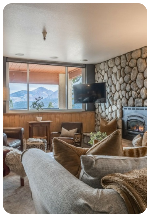
Mammoth Lakes 113 | Page 3 of 8