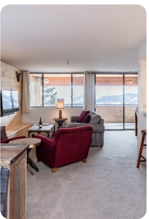
Mammoth Lakes 1 | Page 4 of 7