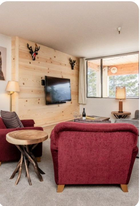
Mammoth Lakes 1 | Page 2 of 7