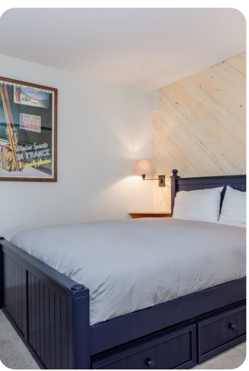
Mammoth Lakes 1 | Page 5 of 7