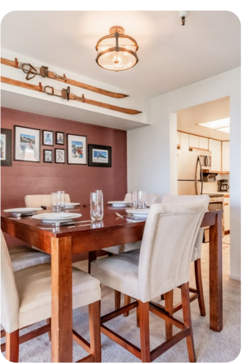
Mammoth Lakes 1 | Page 3 of 7