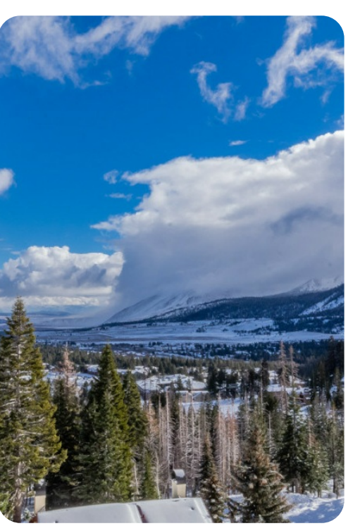
Mammoth Lakes 1 | Page 7 of 7