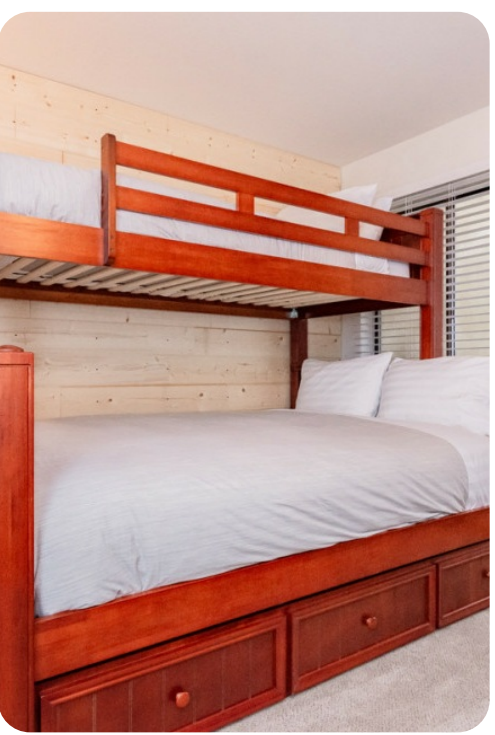
Mammoth Lakes 1 | Page 6 of 7