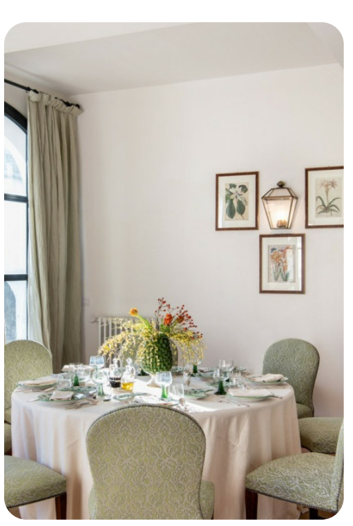
Malin | Page 2 of 6