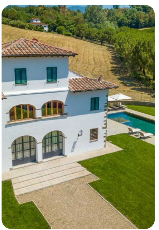
Malin | Page 5 of 6