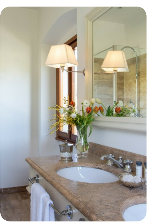
Malin | Page 4 of 6