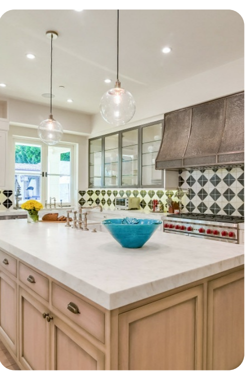
Malibu 4 | Page 4 of 8