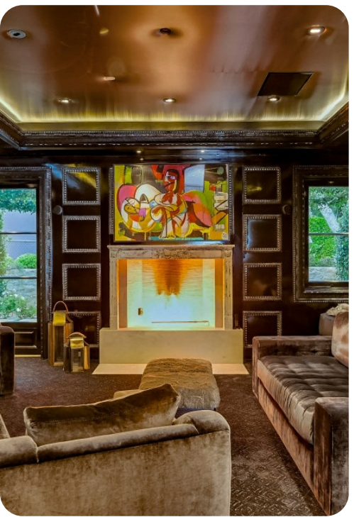
Malibu 4 | Page 7 of 8