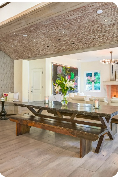
Malibu 4 | Page 3 of 8