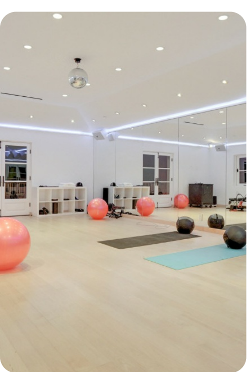
Malibu 4 | Page 5 of 8