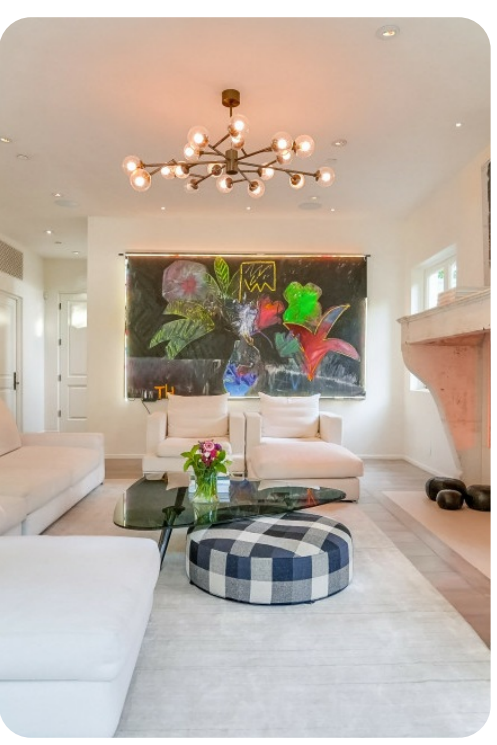
Malibu 4 | Page 2 of 8