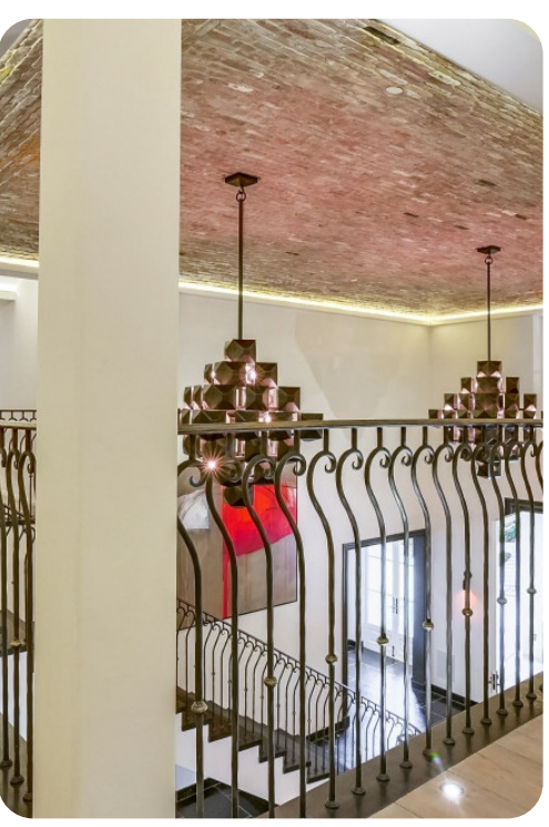
Malibu 4 | Page 6 of 8