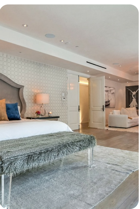
Malibu 4 | Page 8 of 8