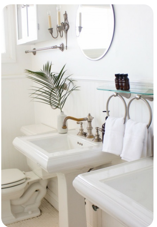
Malibu 19 | Page 4 of 8