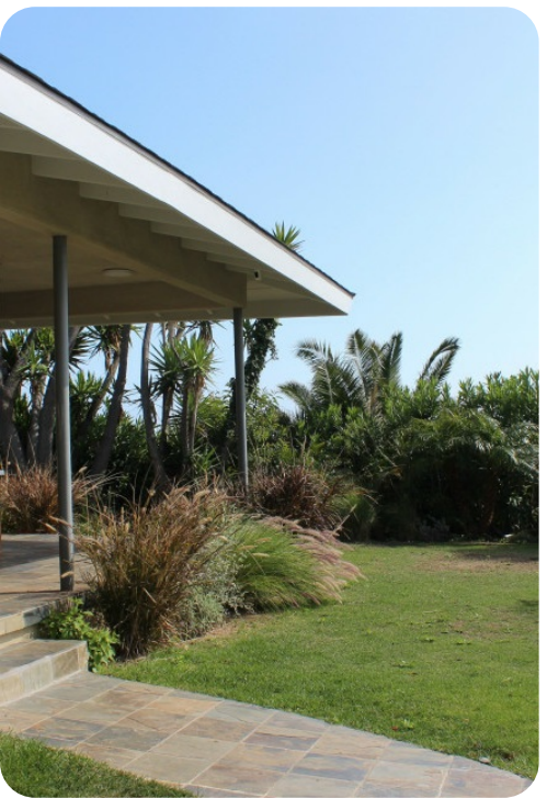
Malibu 19 | Page 7 of 8