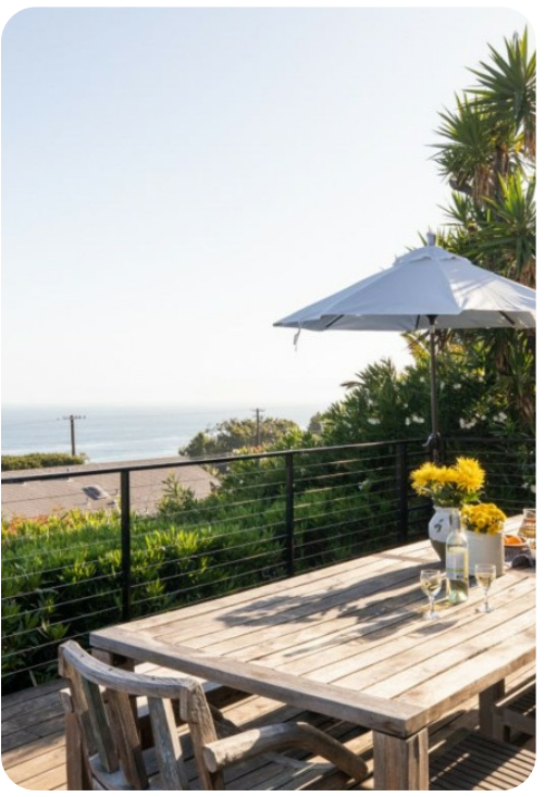
Malibu 19 | Page 5 of 8