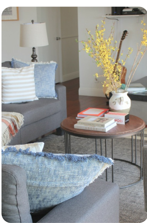
Malibu 19 | Page 2 of 8