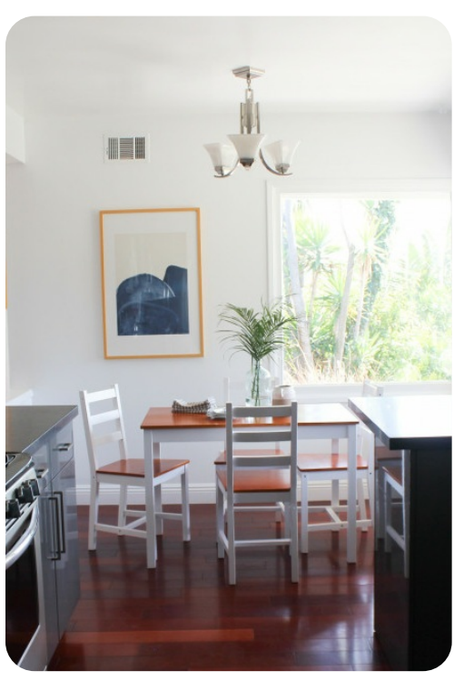
Malibu 19 | Page 3 of 8