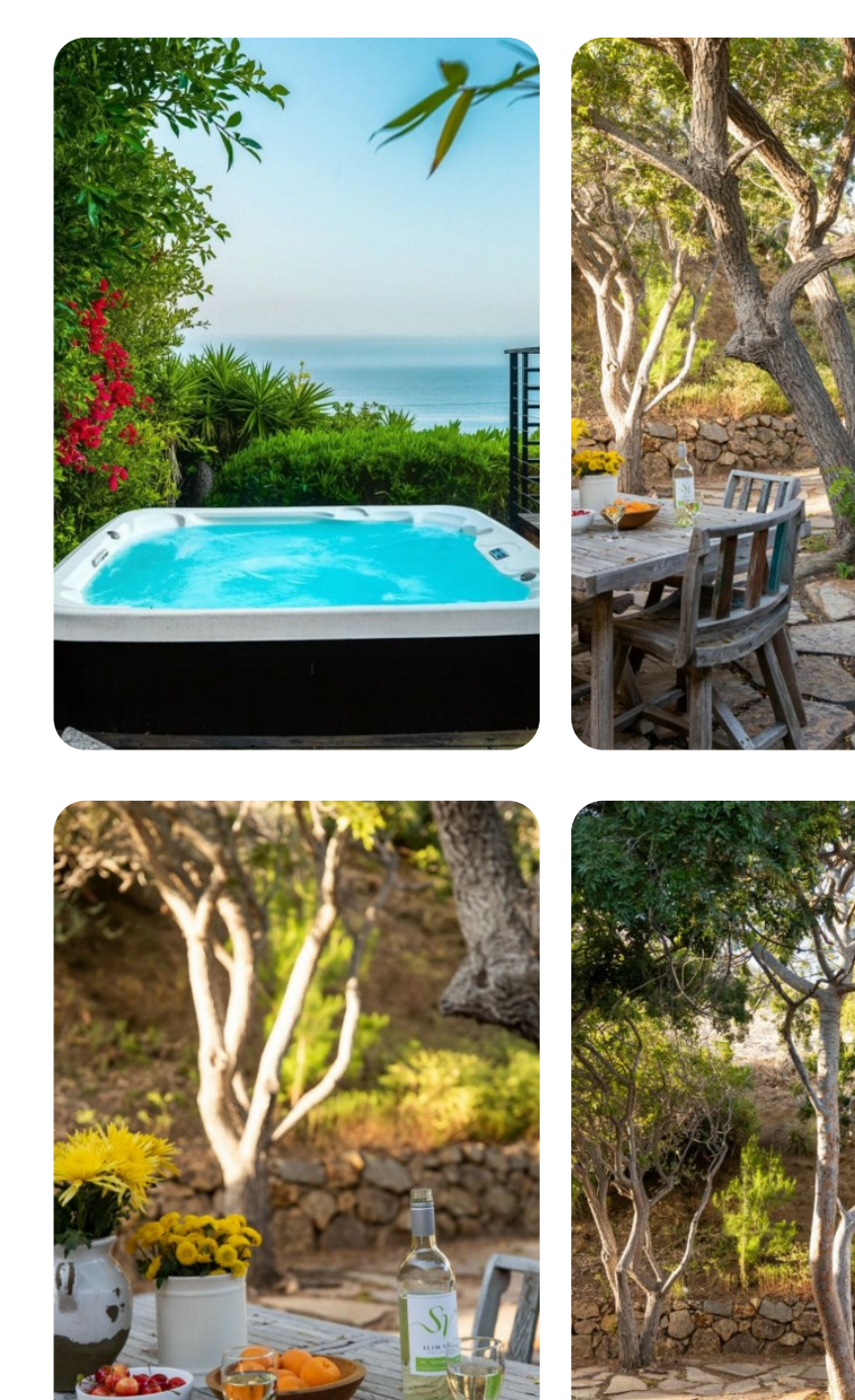
Malibu 19 | Page 6 of 8