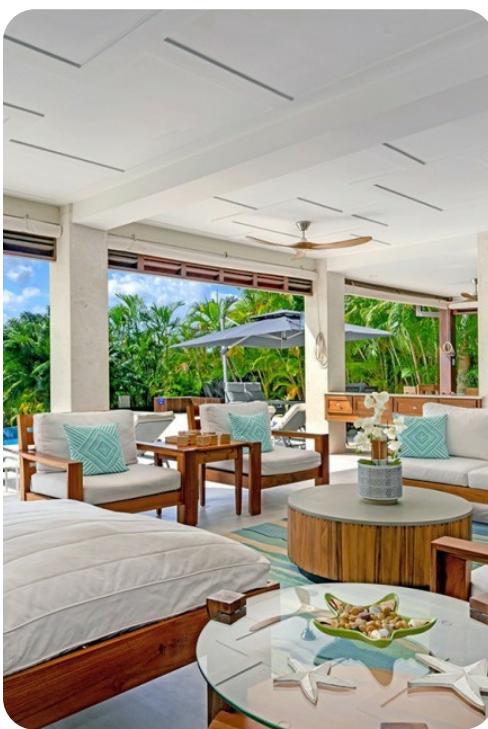
Makana on the Beach | Page 2 of 8