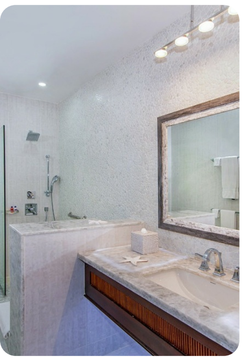
Makana on the Beach | Page 7 of 8