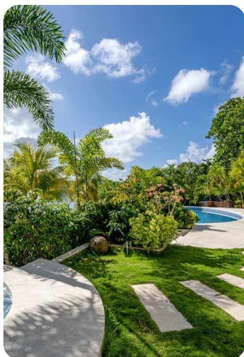
Makana on the Beach | Page 4 of 8