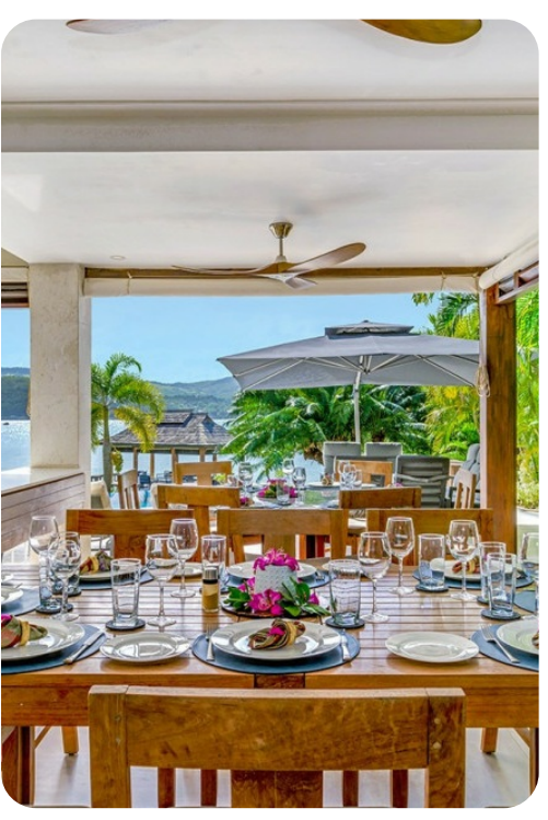
Makana on the Beach | Page 3 of 8