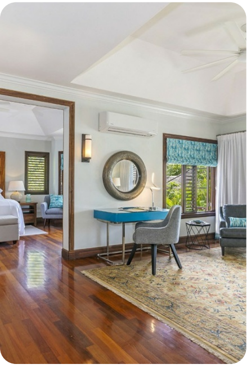
Makana on the Beach | Page 5 of 8