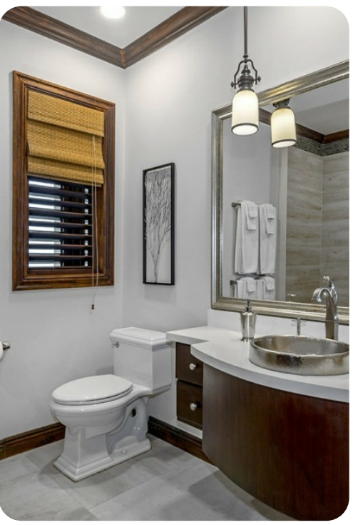
Makana on the Beach | Page 8 of 8