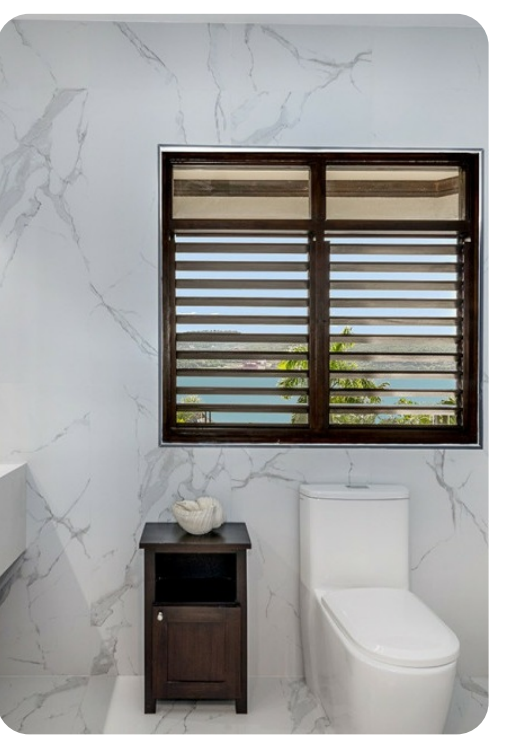
Makana on the Beach | Page 6 of 8