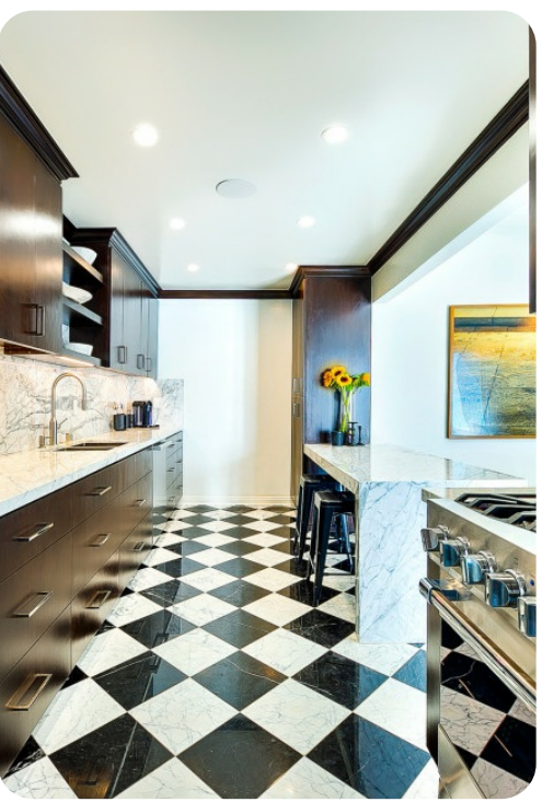
Los Angeles 7 | Page 3 of 8