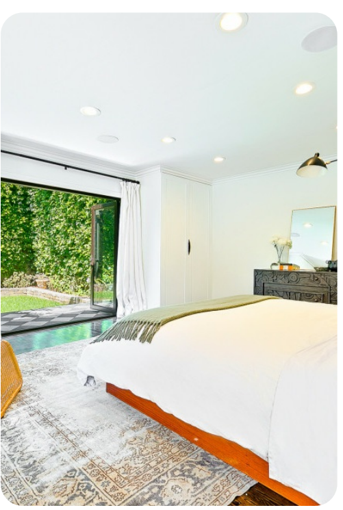
Los Angeles 7 | Page 5 of 8