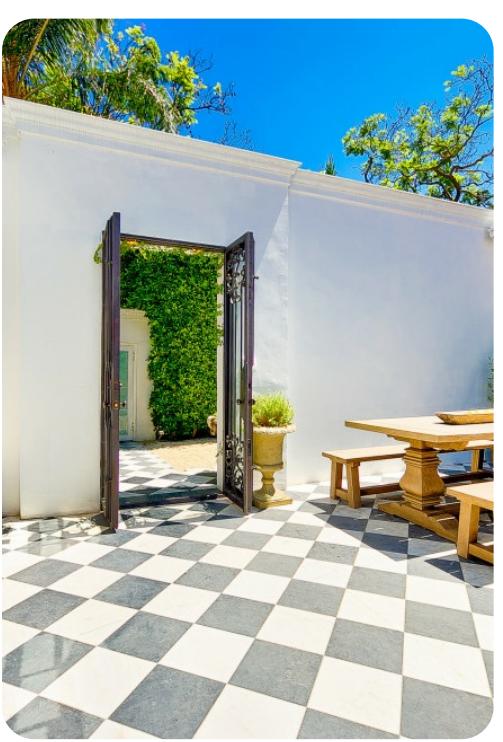
Los Angeles 7 | Page 8 of 8