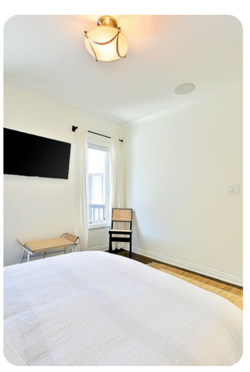
Los Angeles 7 | Page 7 of 8