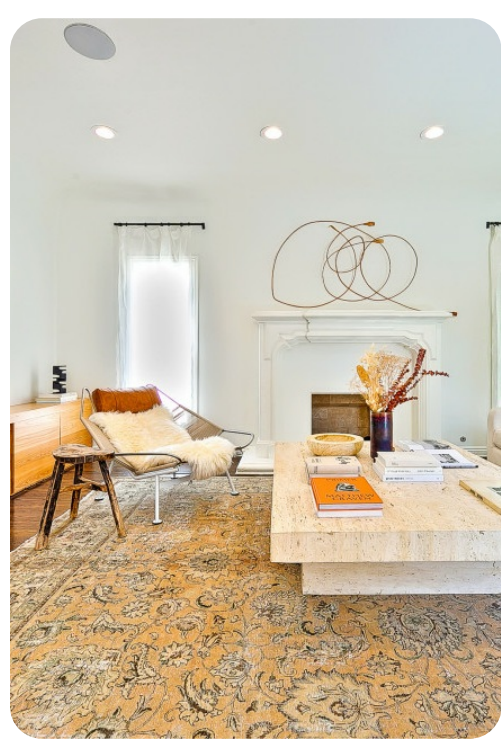
Los Angeles 7 | Page 2 of 8