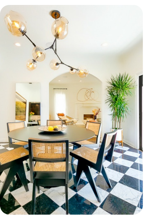
Los Angeles 7 | Page 4 of 8