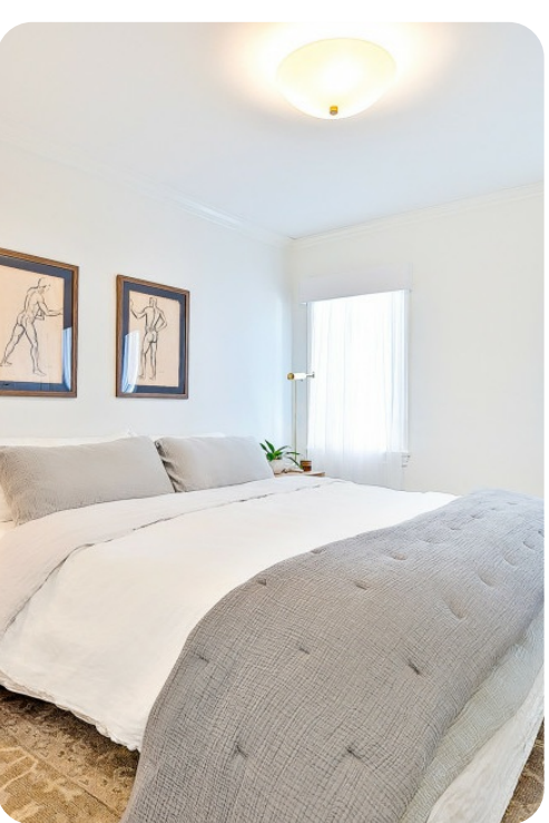
Los Angeles 7 | Page 6 of 8